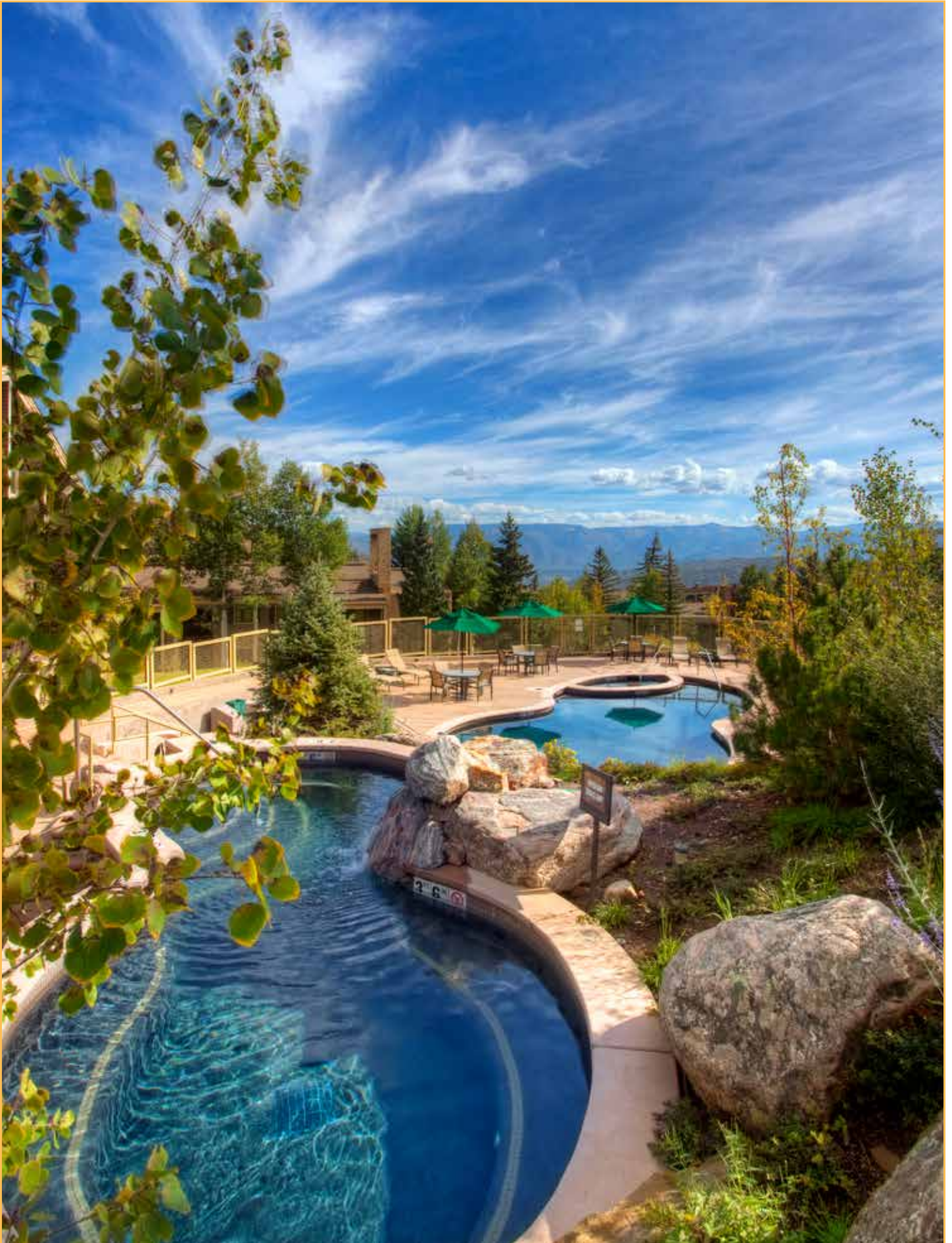
The Timberline features a pool, two hot tubs, and a fire pit, all right on the slopes!