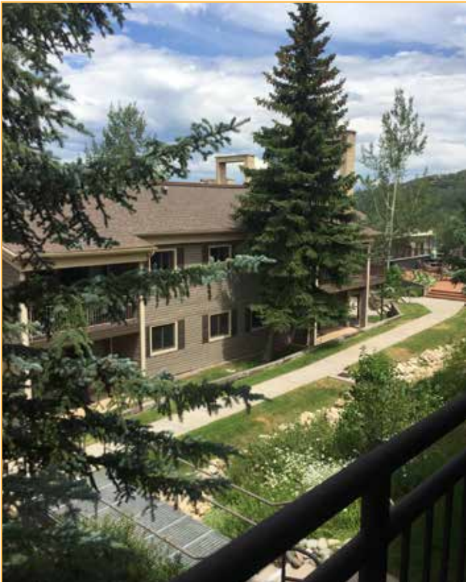
Summer view from C-2C deck