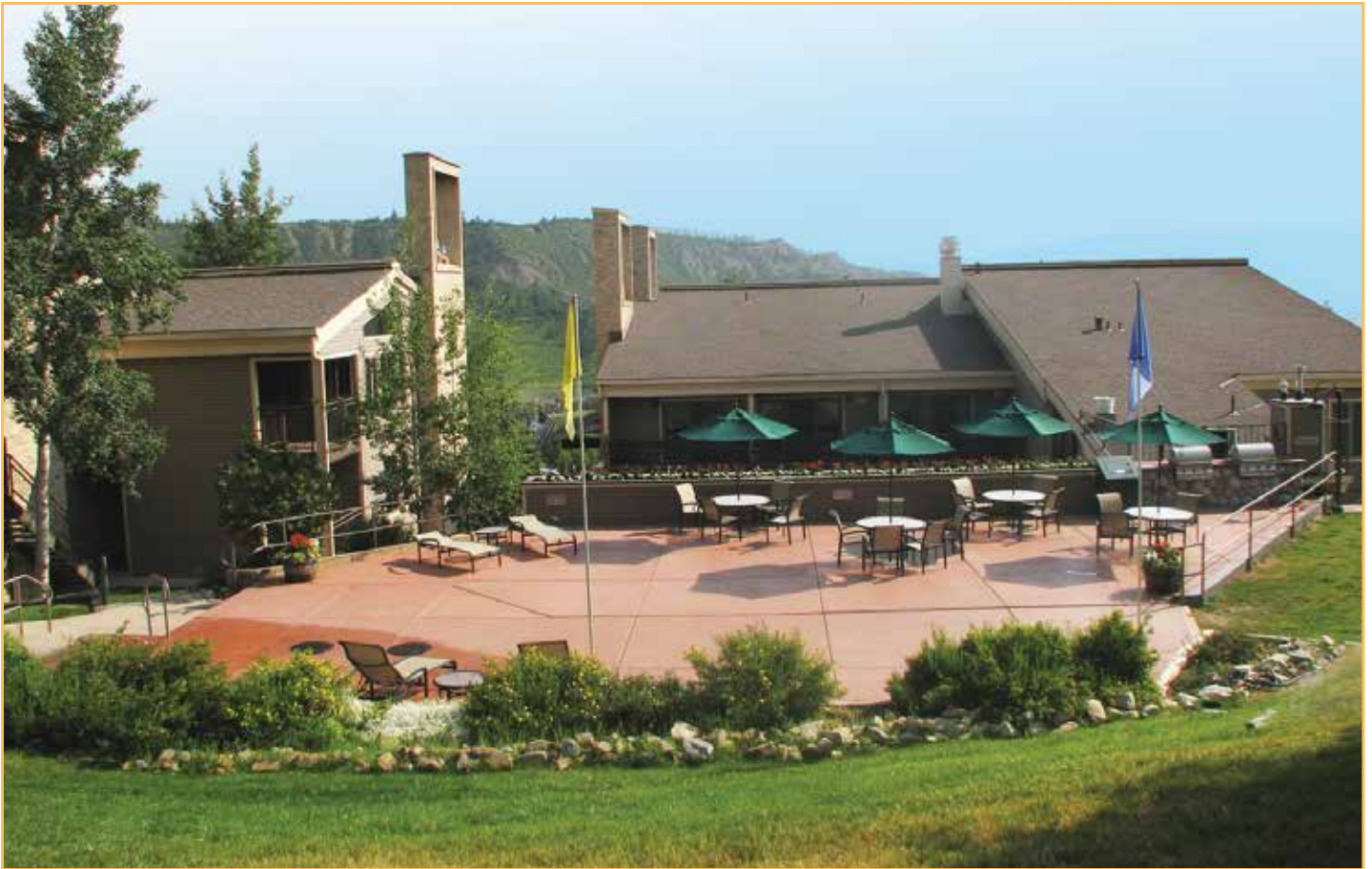
The Timberline's sundeck, firepit and BBQ grilling area