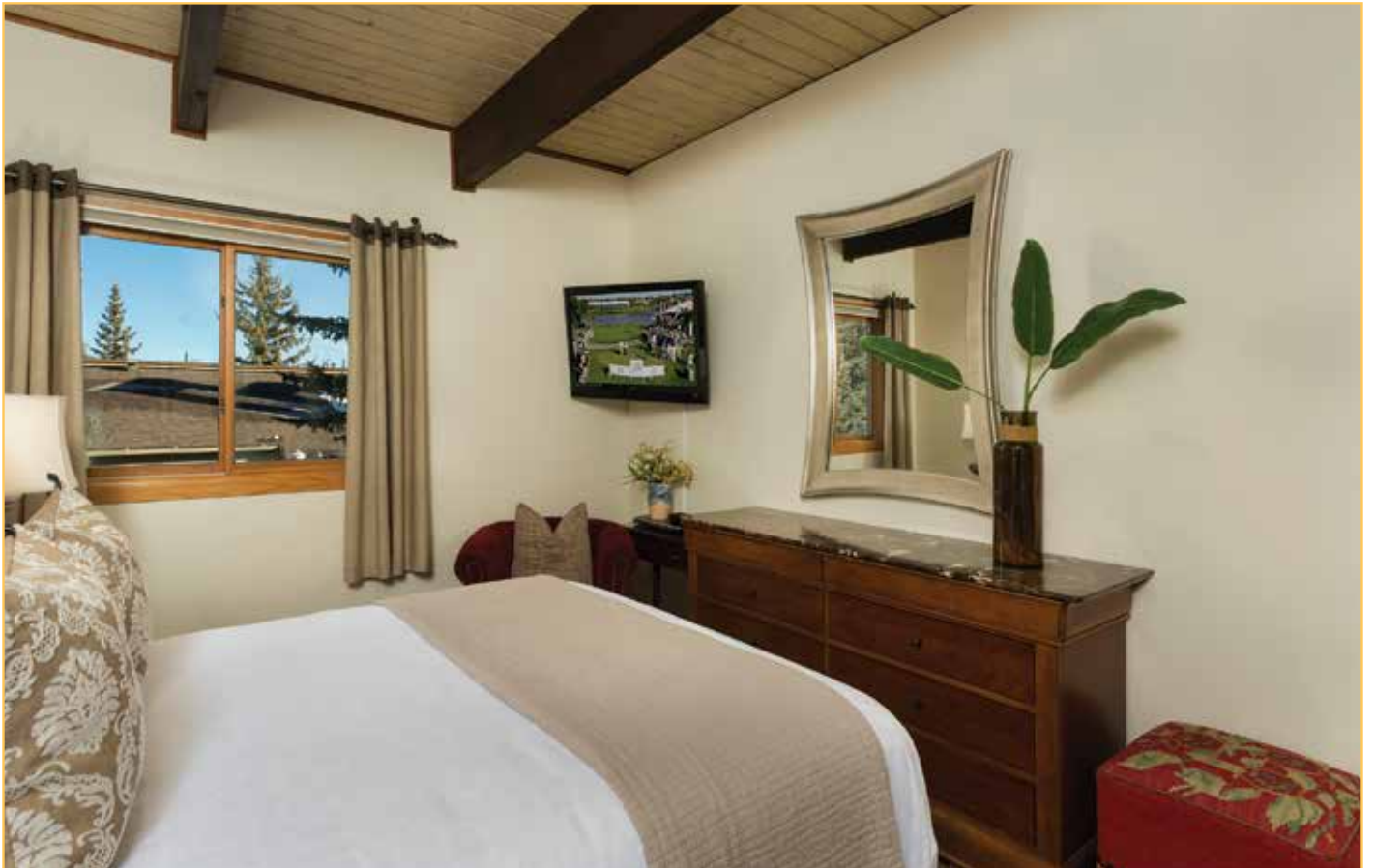
Wake up to sunshine on the slopes