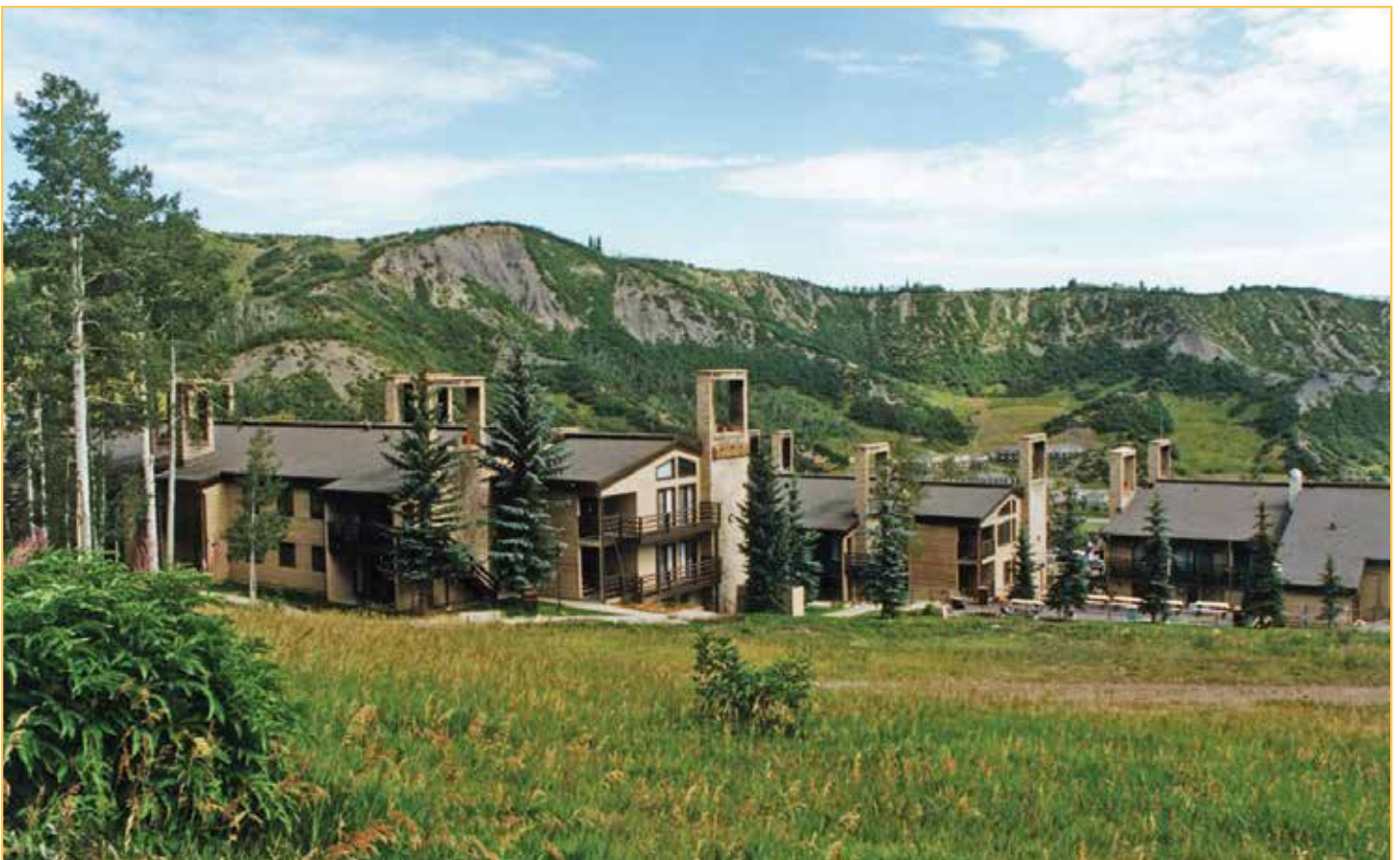
In summer, a host of hiking and biking trails are right outside your door