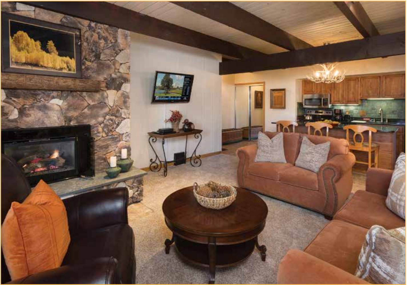
Open living area with gas fireplace