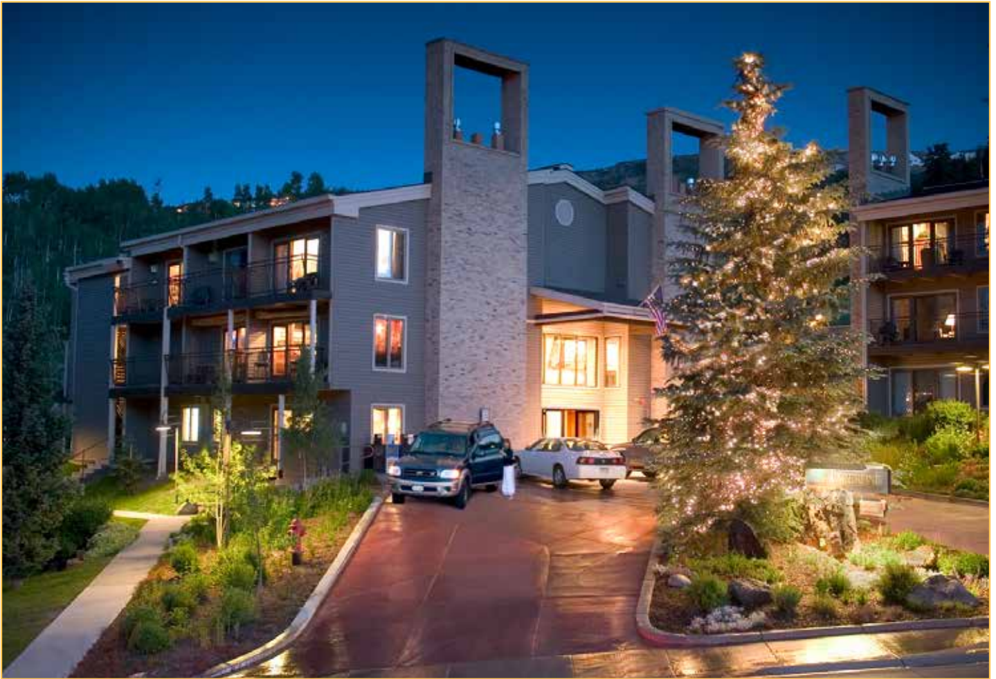
The Timberline arrival scene