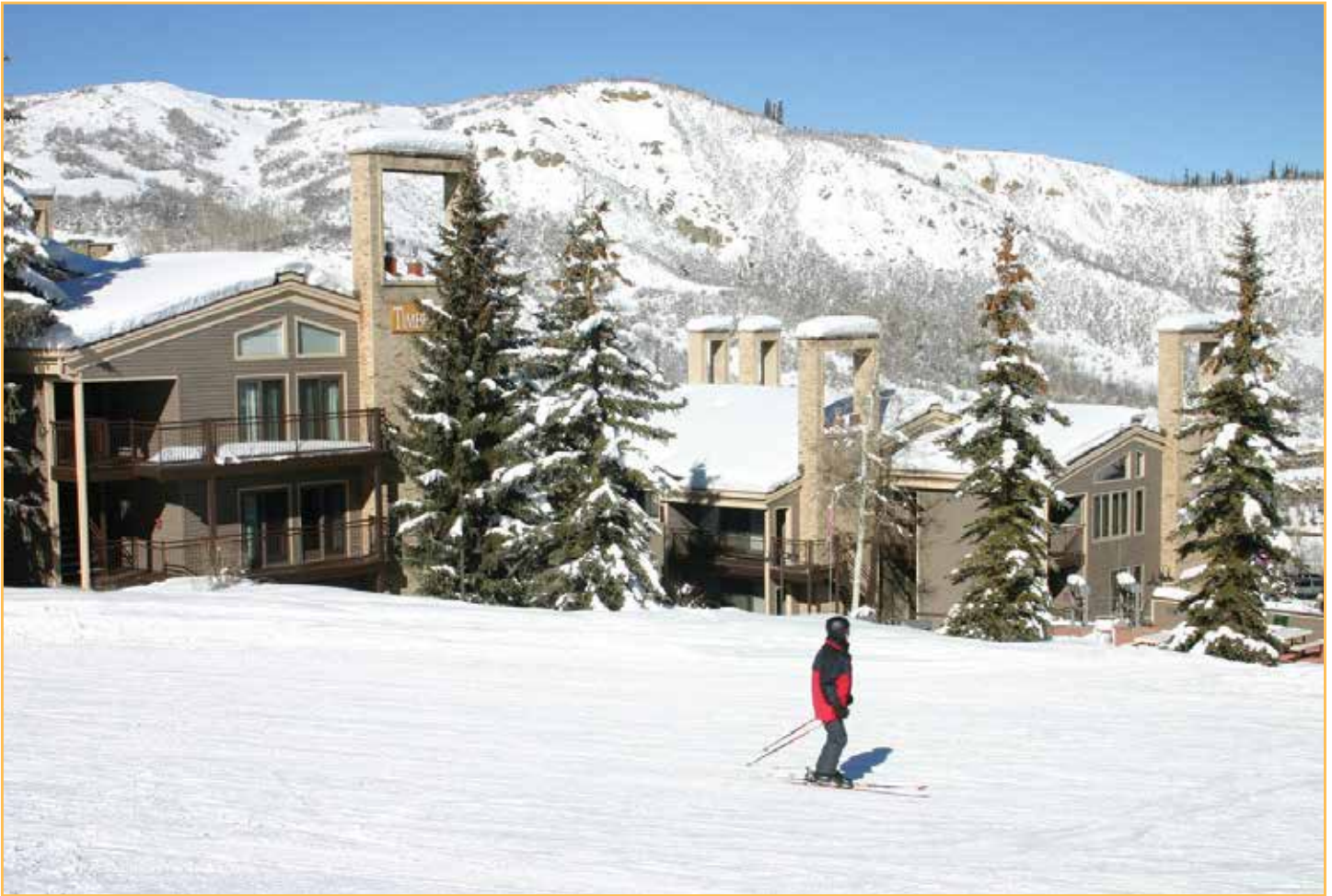
Perfect ski access to Fanny Hill and all of Snowmass Mountain