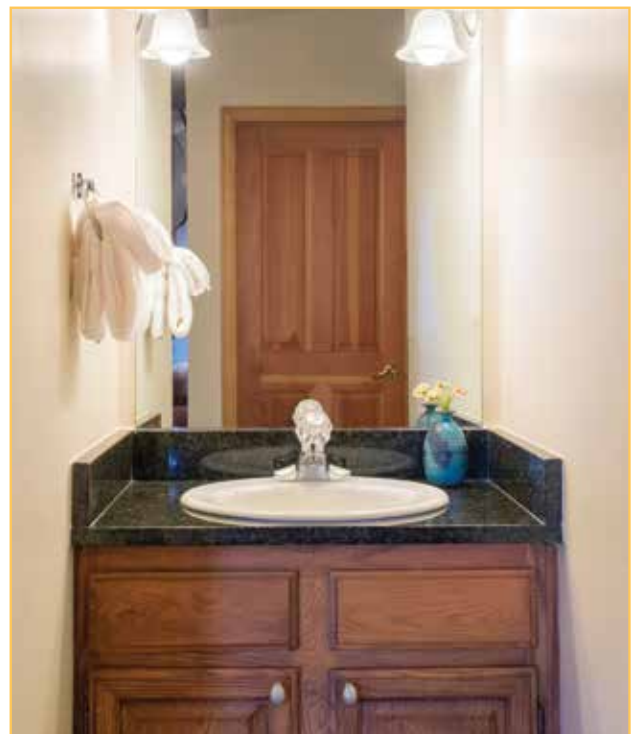
Extra vanity and sink