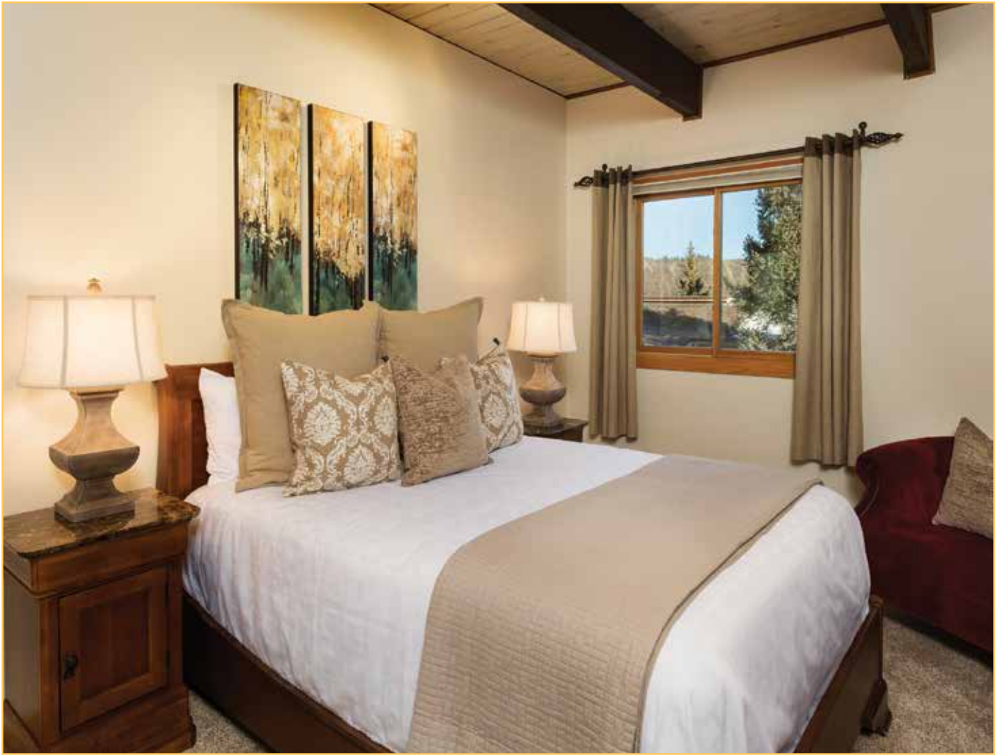
Fresh paint, new carpet, linens, curtains and accessories