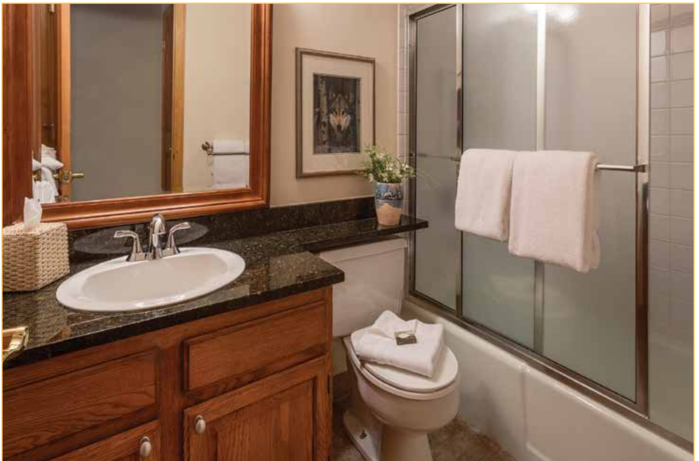
Full bath with granite countertop