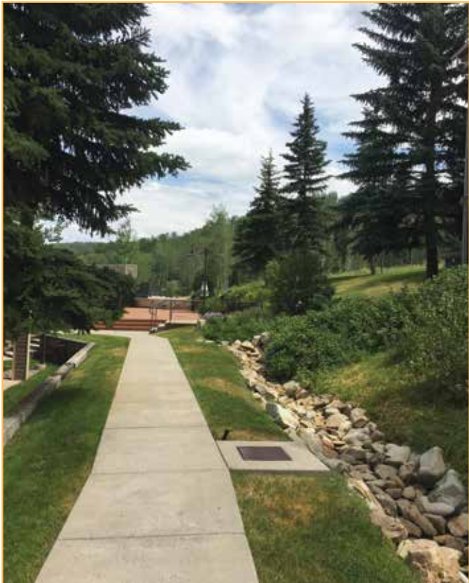
Just steps to the great outdoors for hiking and biking