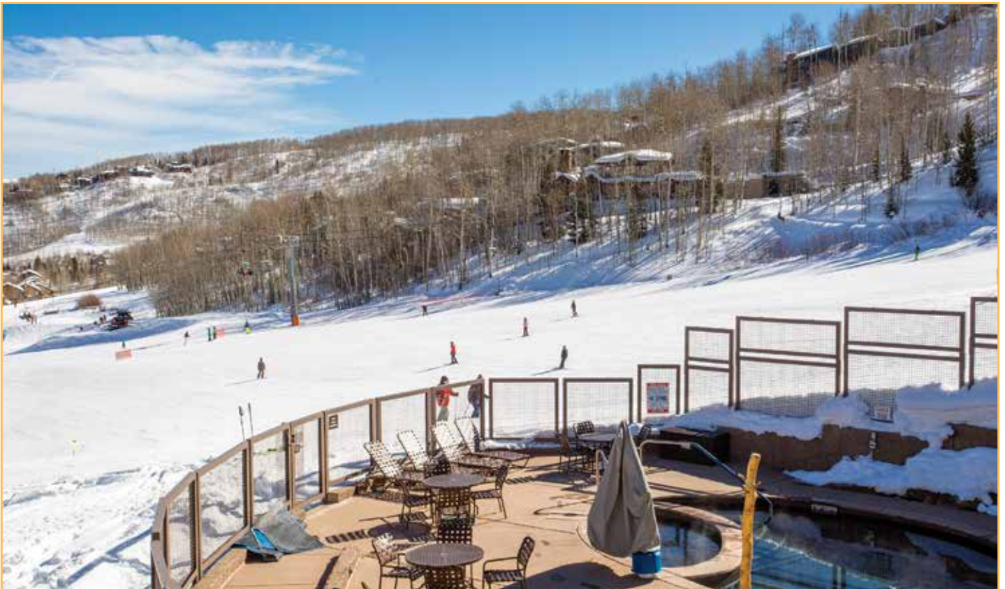
Winter pool scene