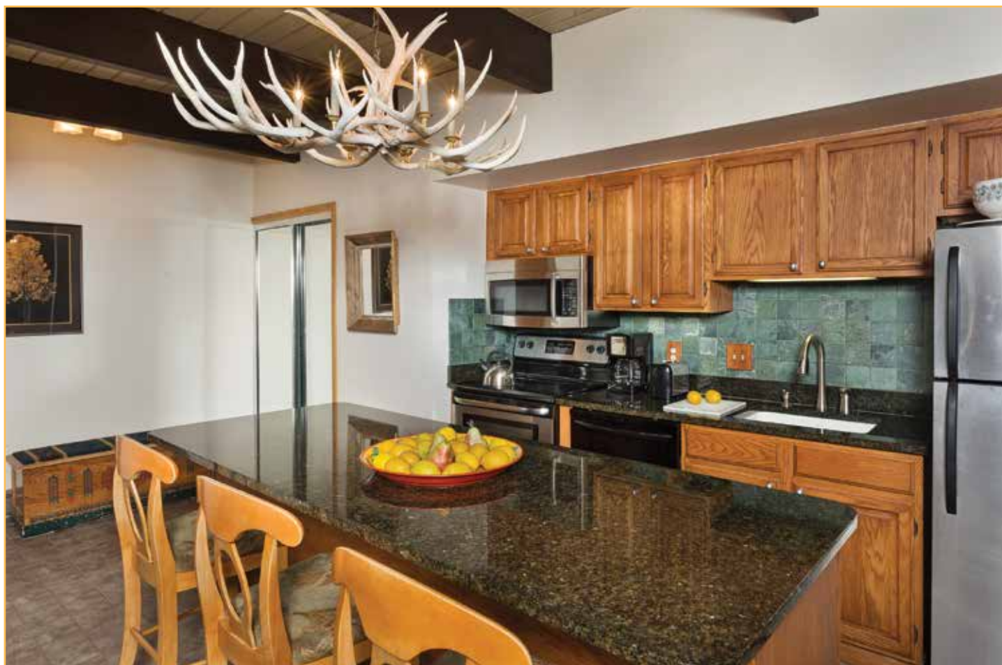
Bright kitchen open to the living area