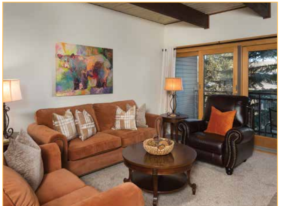
Cozy condominium with private deck