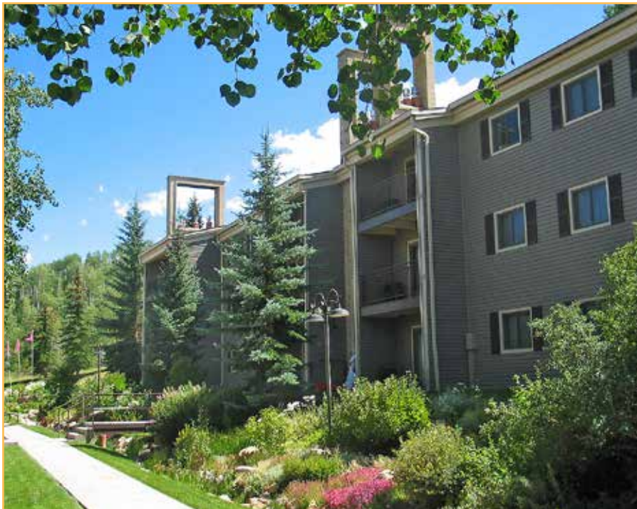
Just steps on this path to the slopes and Fanny Hill