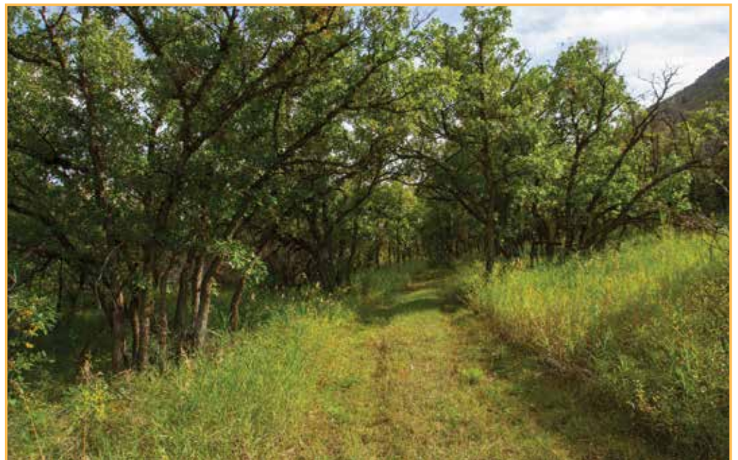
Hike the public lands that surround the lot