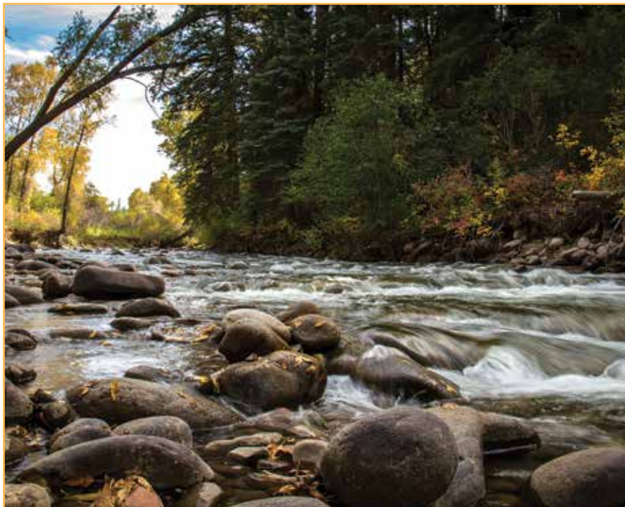
Enjoy the sounds of the river in all seasons

DISCLOSURE: Information herein deemed reliable, but not guaranteed. Due to differences in measurement methods, neither Seller nor Broker can warrant the square footage of any structure or the size of any land being purchased. Broker measurements are for marketing purposes and are not measurements for loan, valuation or any other purpose. If exact square footage is a concern, the property should be independently measured.