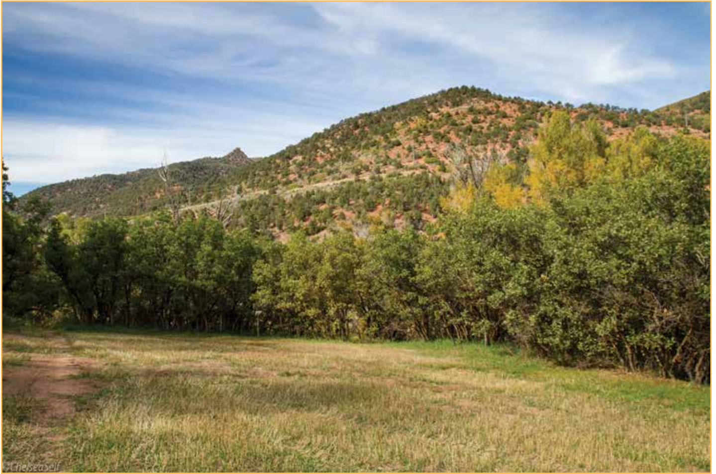
Welcome to Snowmass Creek

What: Great vacant lot located on the corner of Snowmass Creek Road and HWY 82.