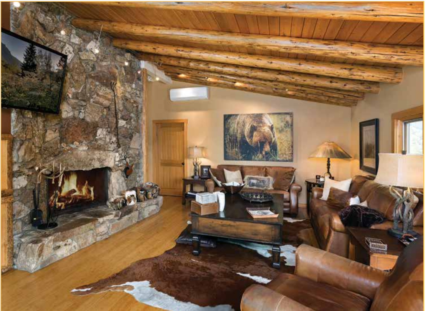
Living area with massive stone fireplace