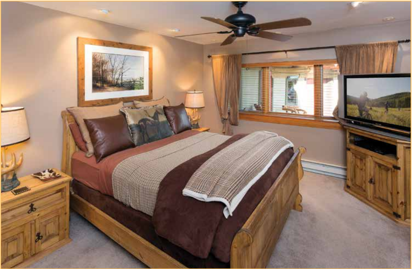
Downstairs guest room