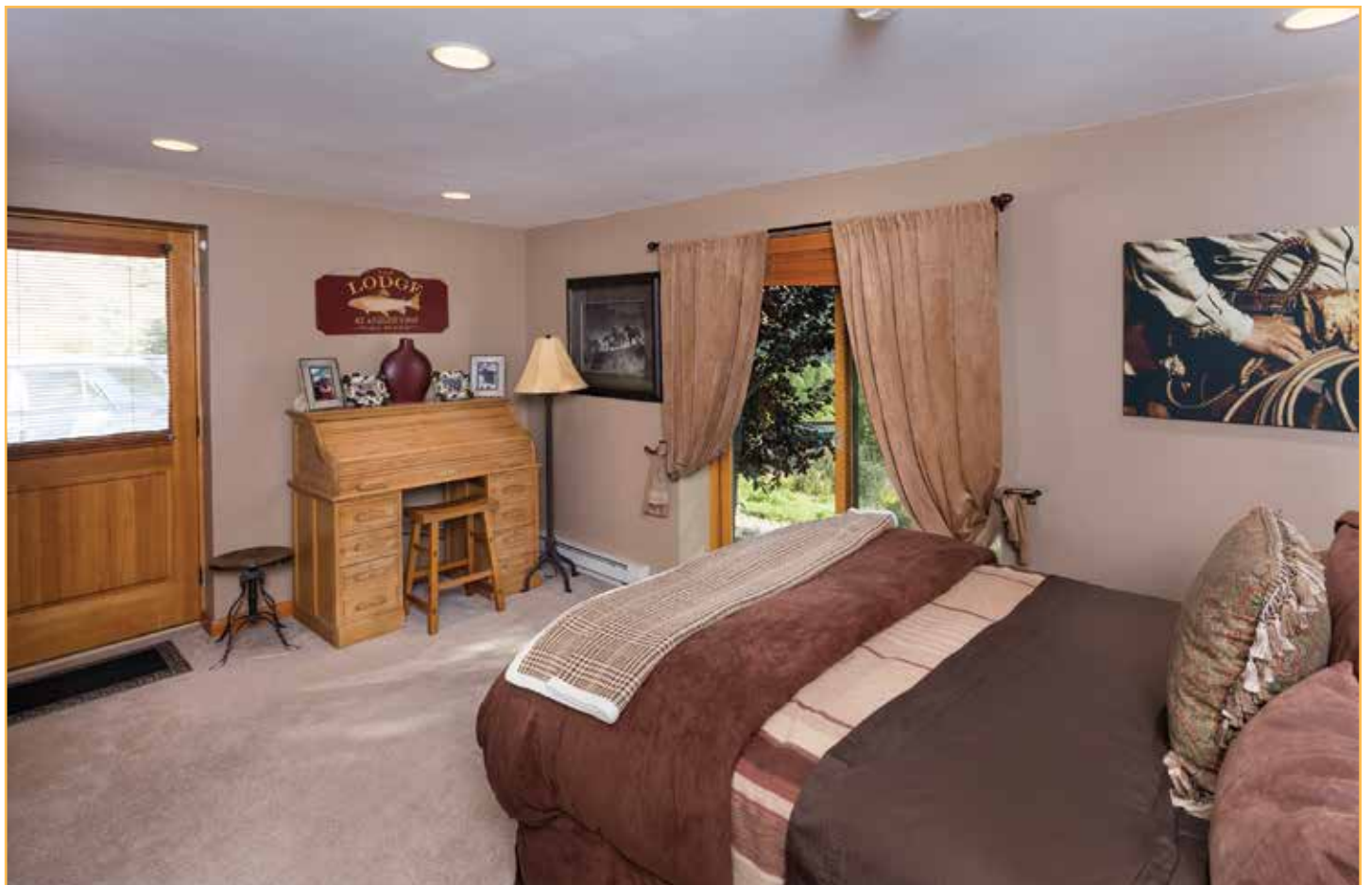
Downstairs guest room 3