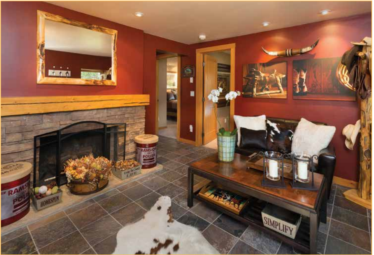
Family room with fireplace