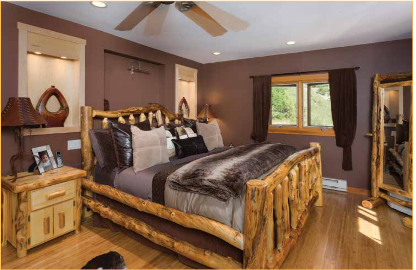
Large master suite with fireplace and comfortable seating area