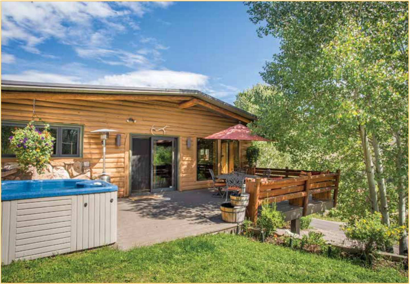
Deck with hot tub