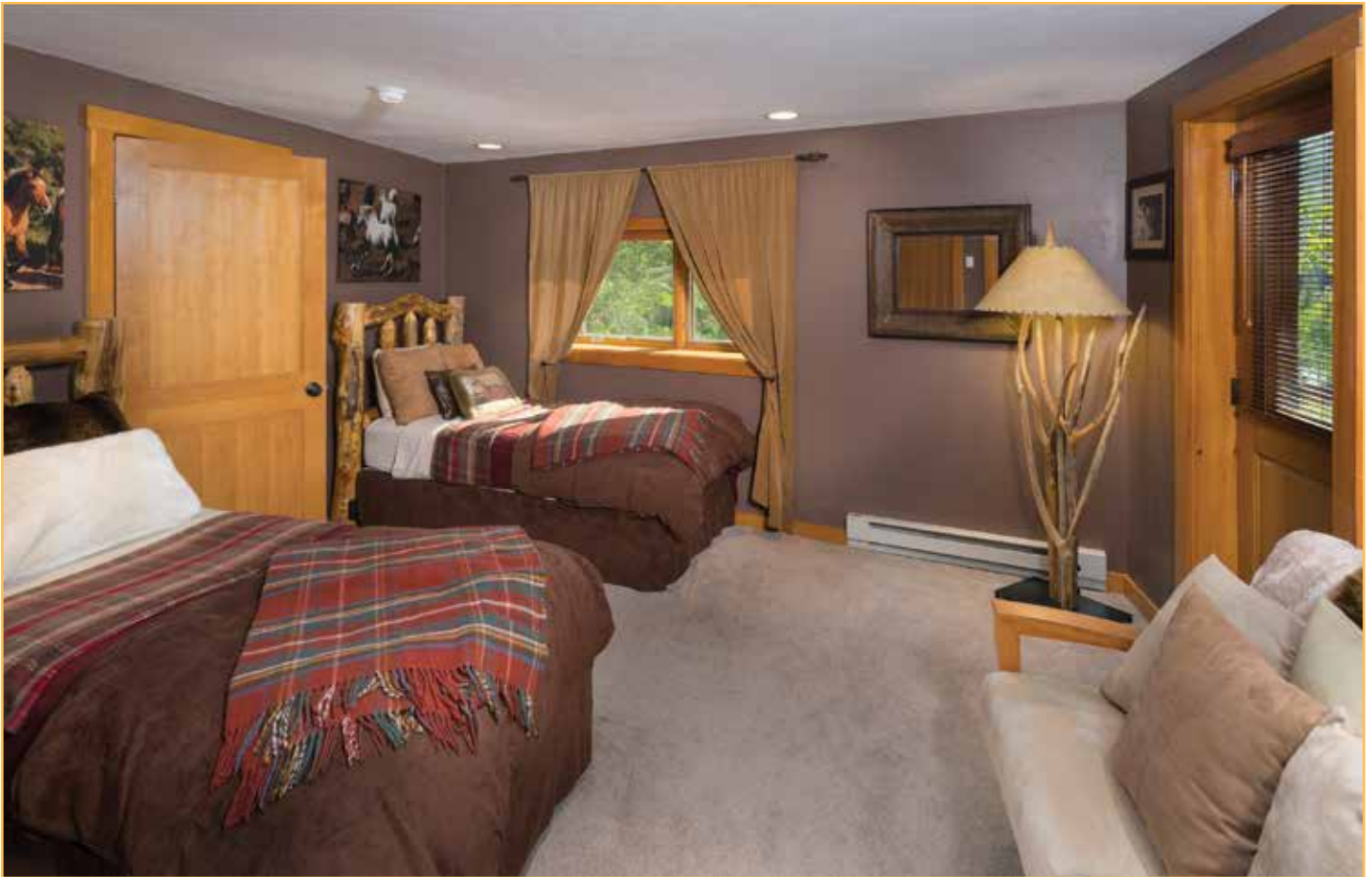
Downstairs guest room 2