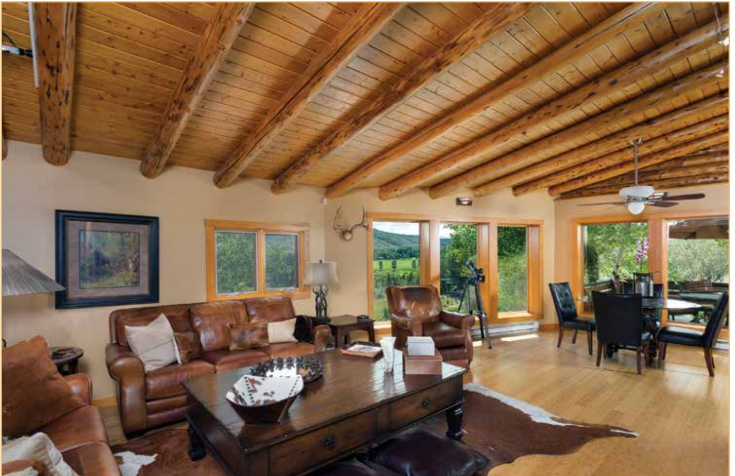
Open living area with exposed beam ceilings and Snowmass Creek valley views