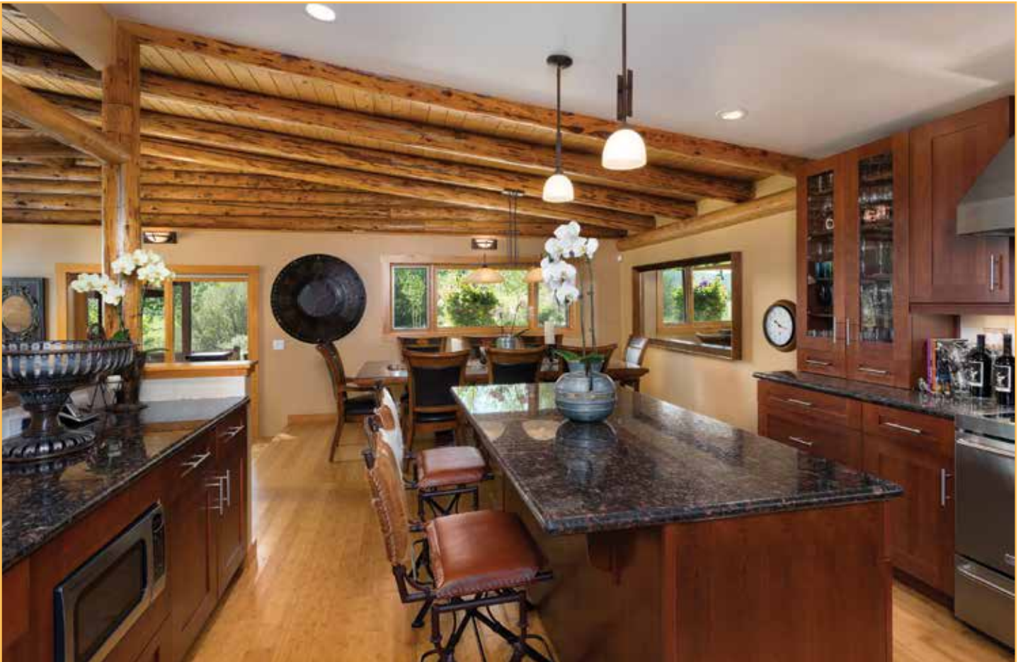
Kitchen with stainless appliances and cherry cabinetry