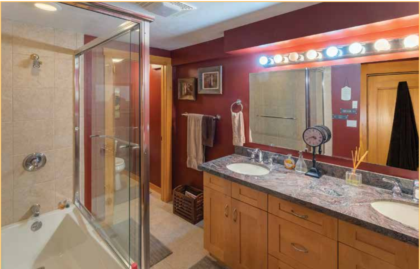
Downstairs guest bath