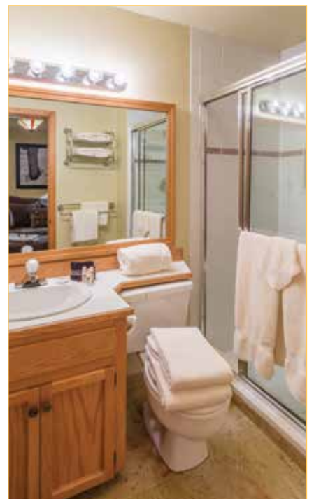
Master suite bath