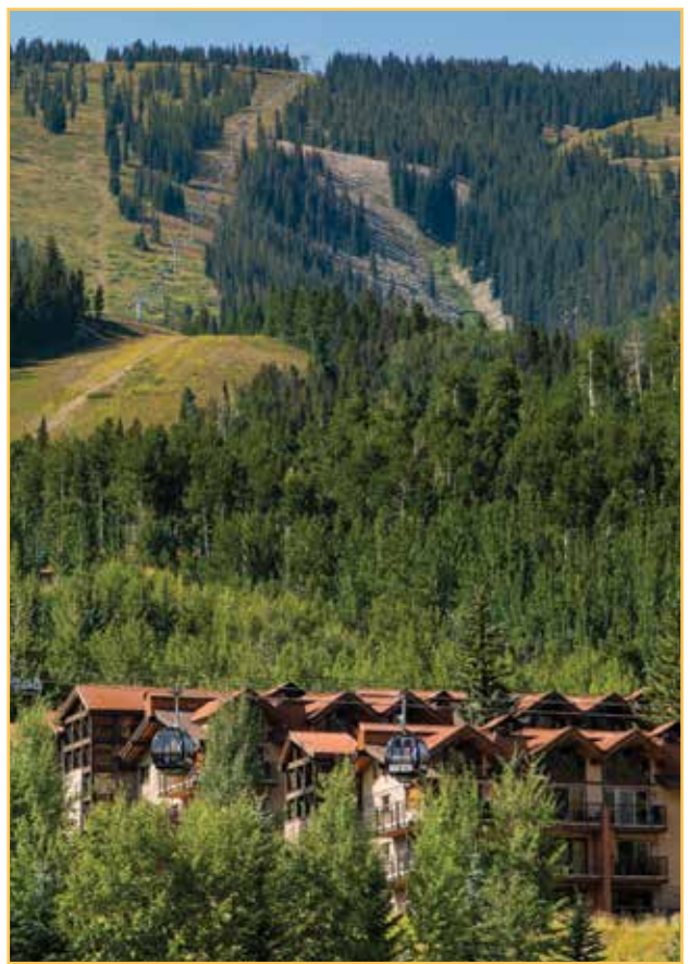
The Crestwood in summer