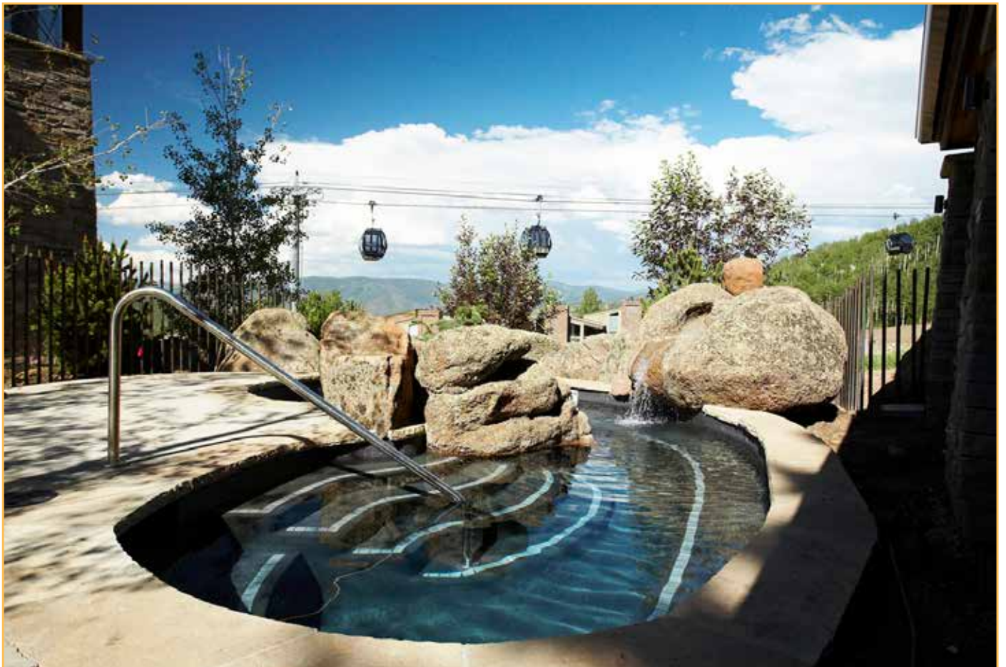
Just steps to one of two spas on Crestwood grounds—this one enjoys views of the gondola