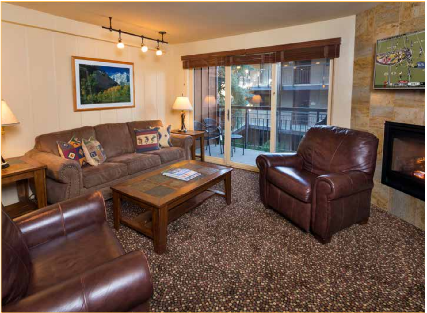
Spacious and open