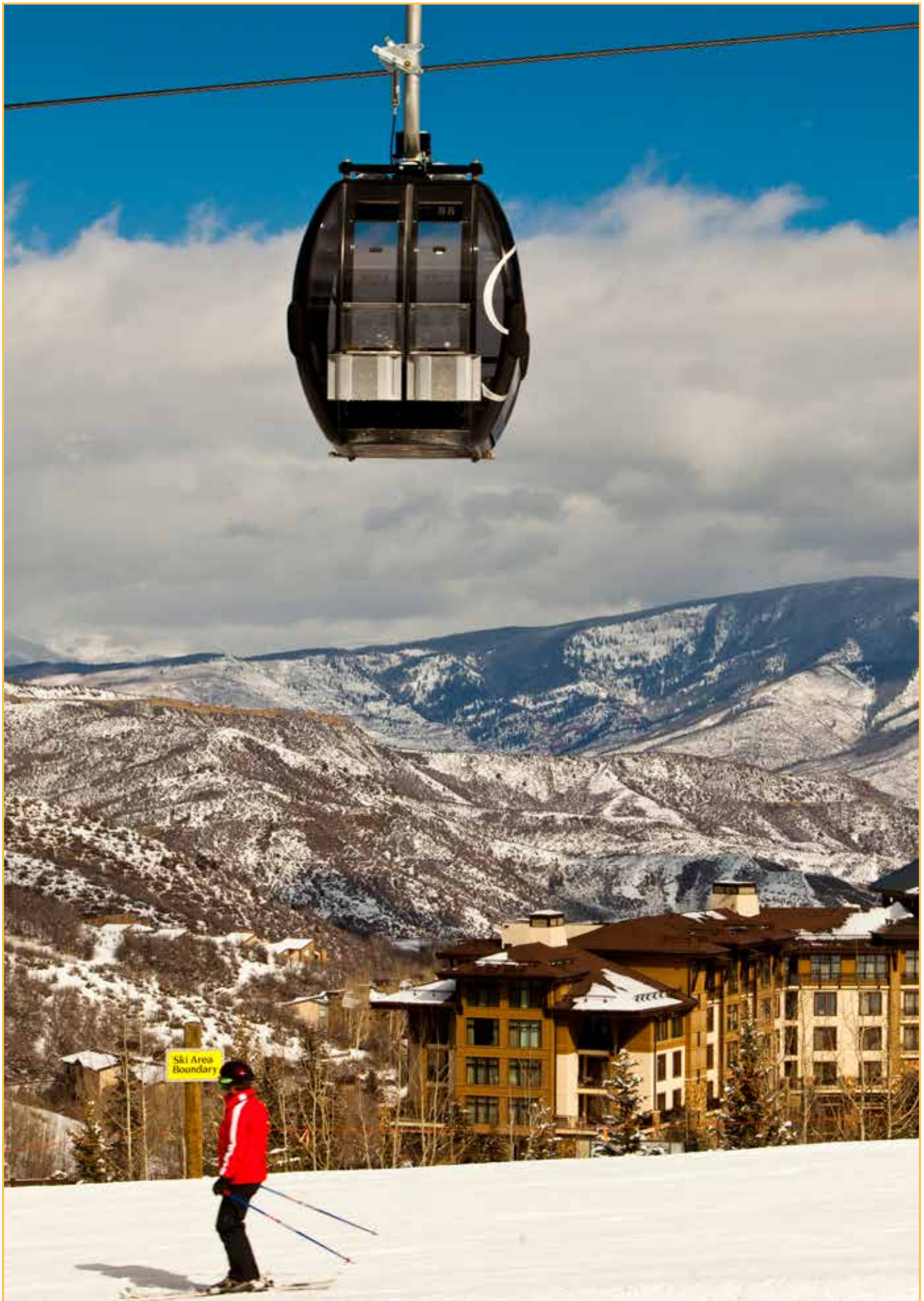
Easy access to Assay Hill, Elk Camp Gondola and Base Village from The Crestwood