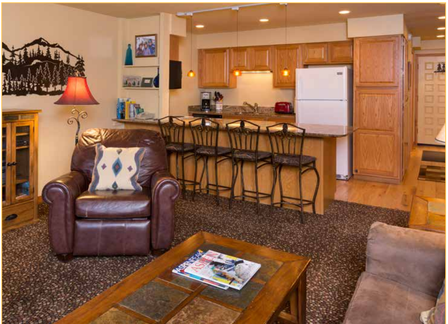
Open kitchen with breakfast bar