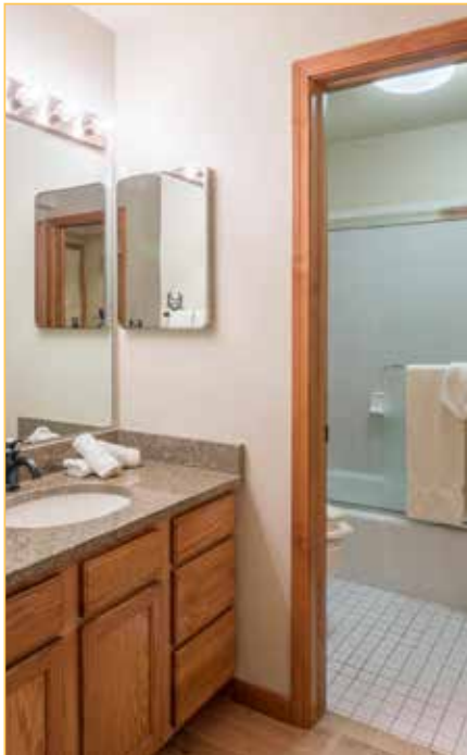
Guest suite bath