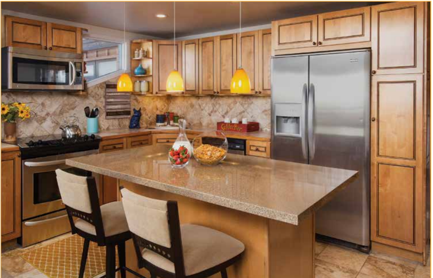
Open kitchen, completely renovated and accessorized