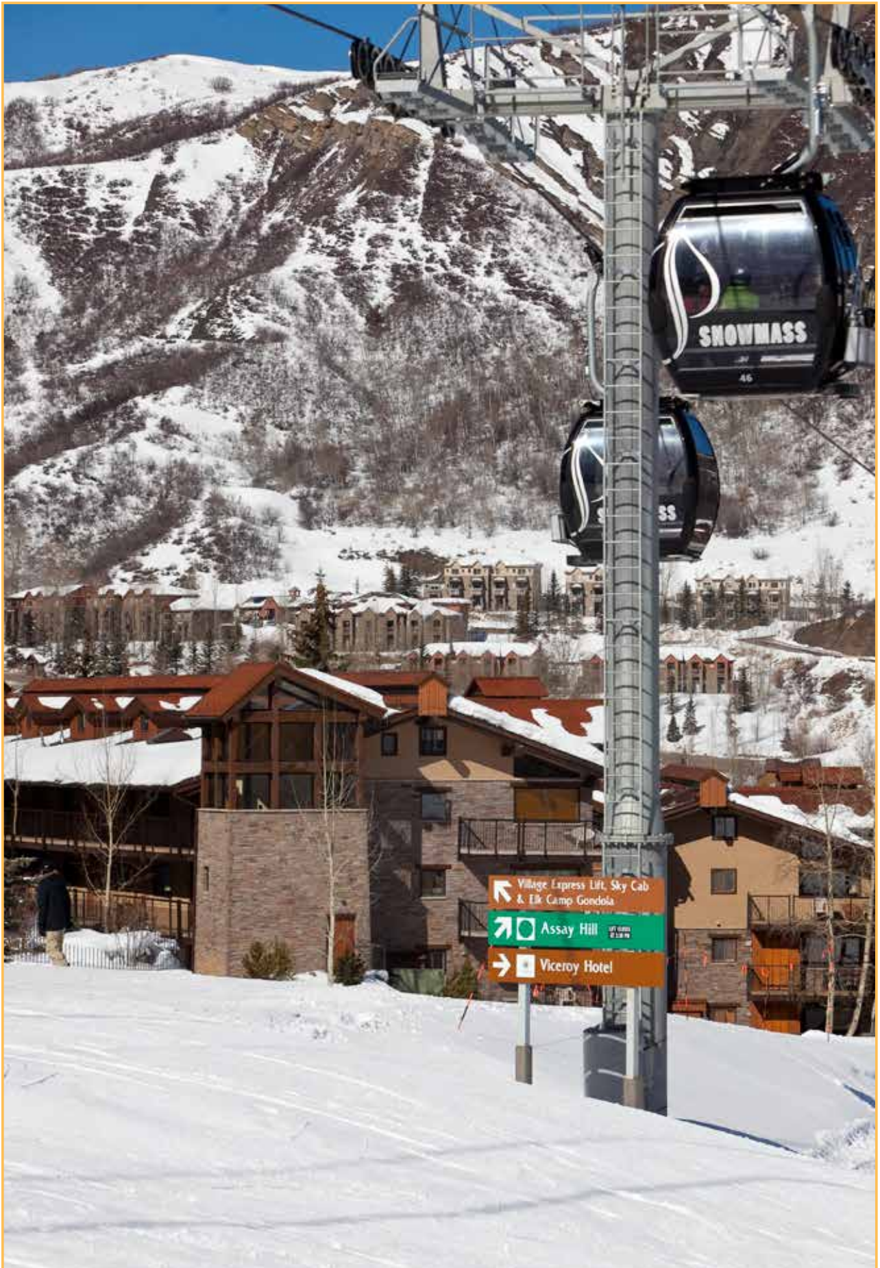
Ski access trails