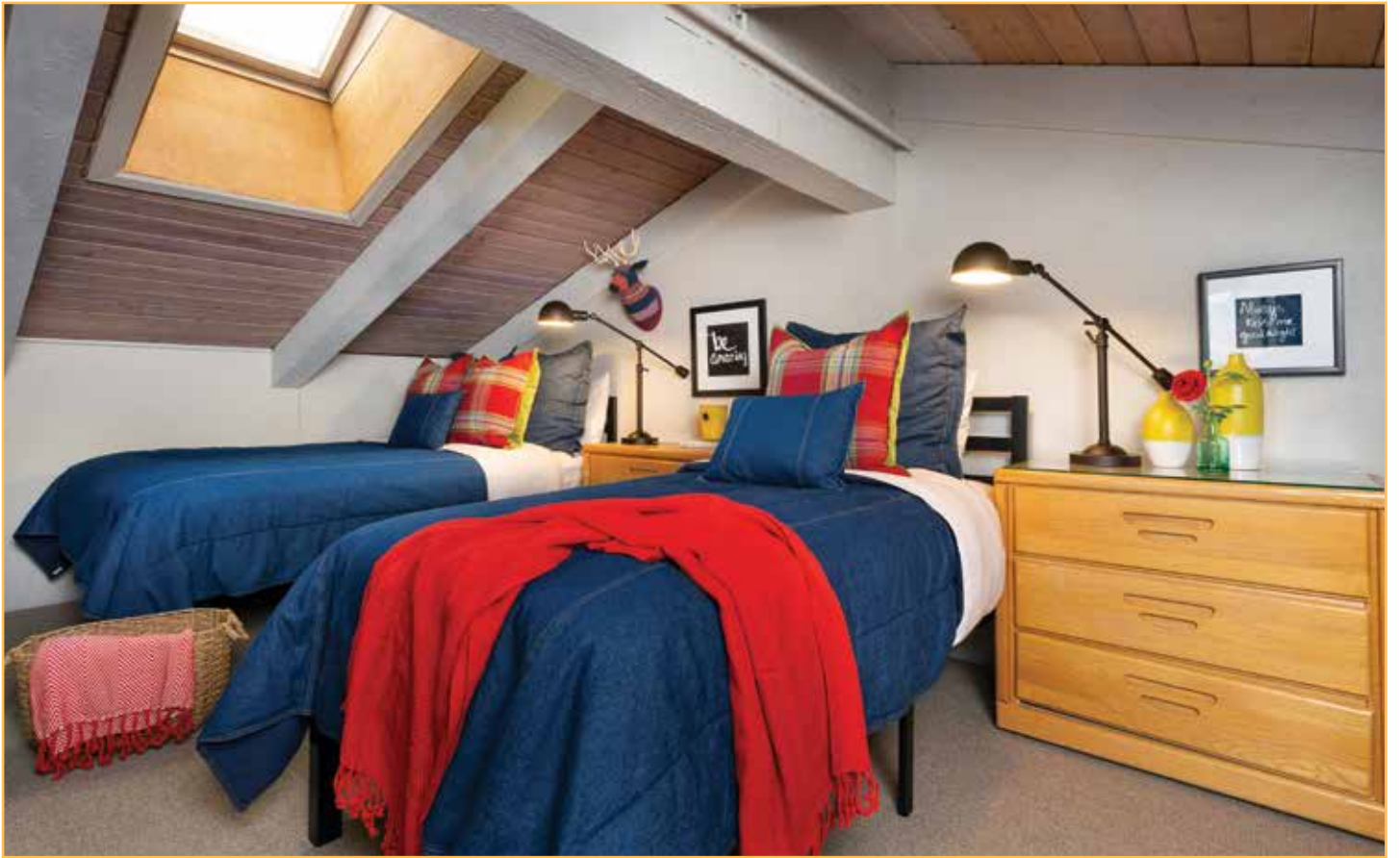
Loft area with sleeping for three under the skylight