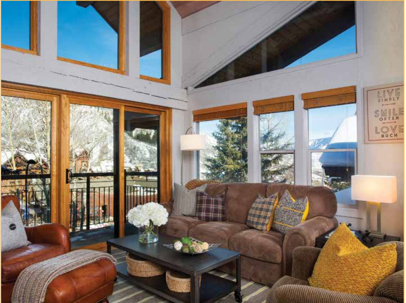
Living room features wrap-around windows overlooking Fanny Hill and Base Village