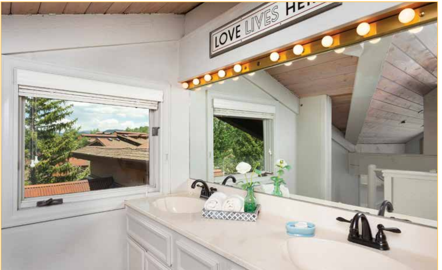
Loft bath with double sink vanity