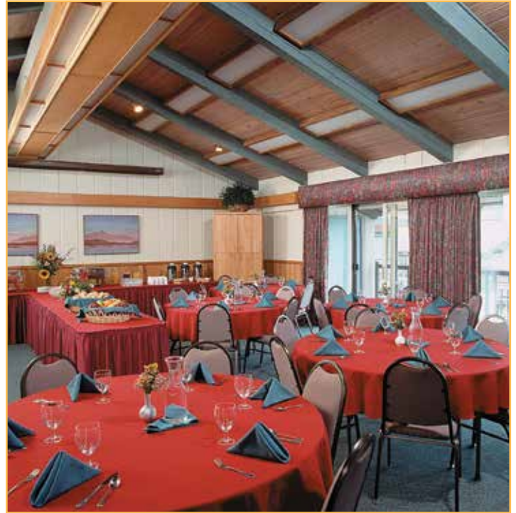
One of two conference rooms