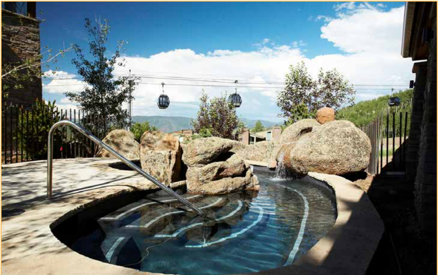
Just steps to one of two spas on Crestwood grounds–this one enjoys views of the gondola