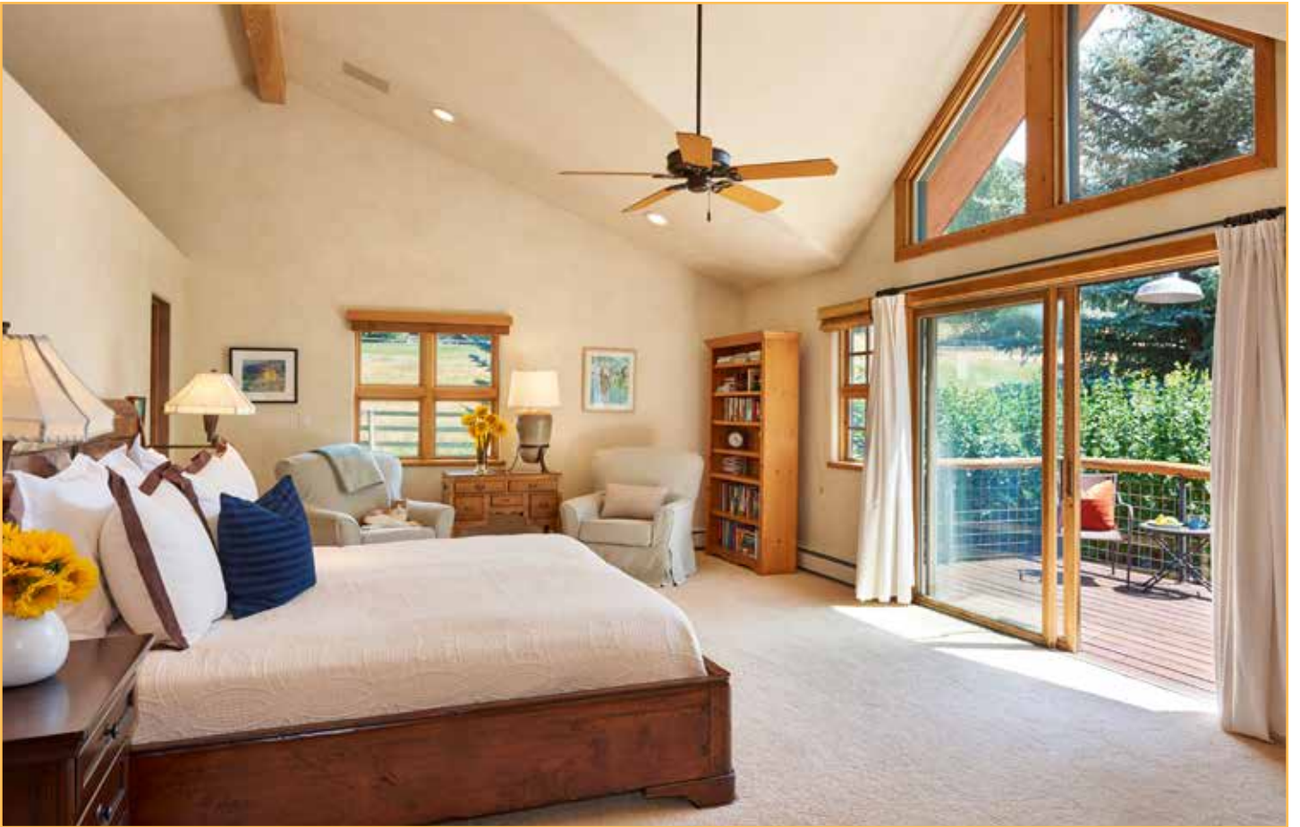
Master bedroom with doors to deck overlooking gardens