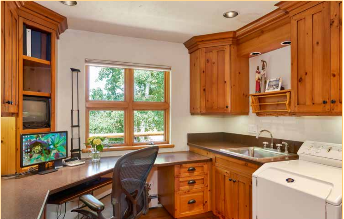
Office and laundry area