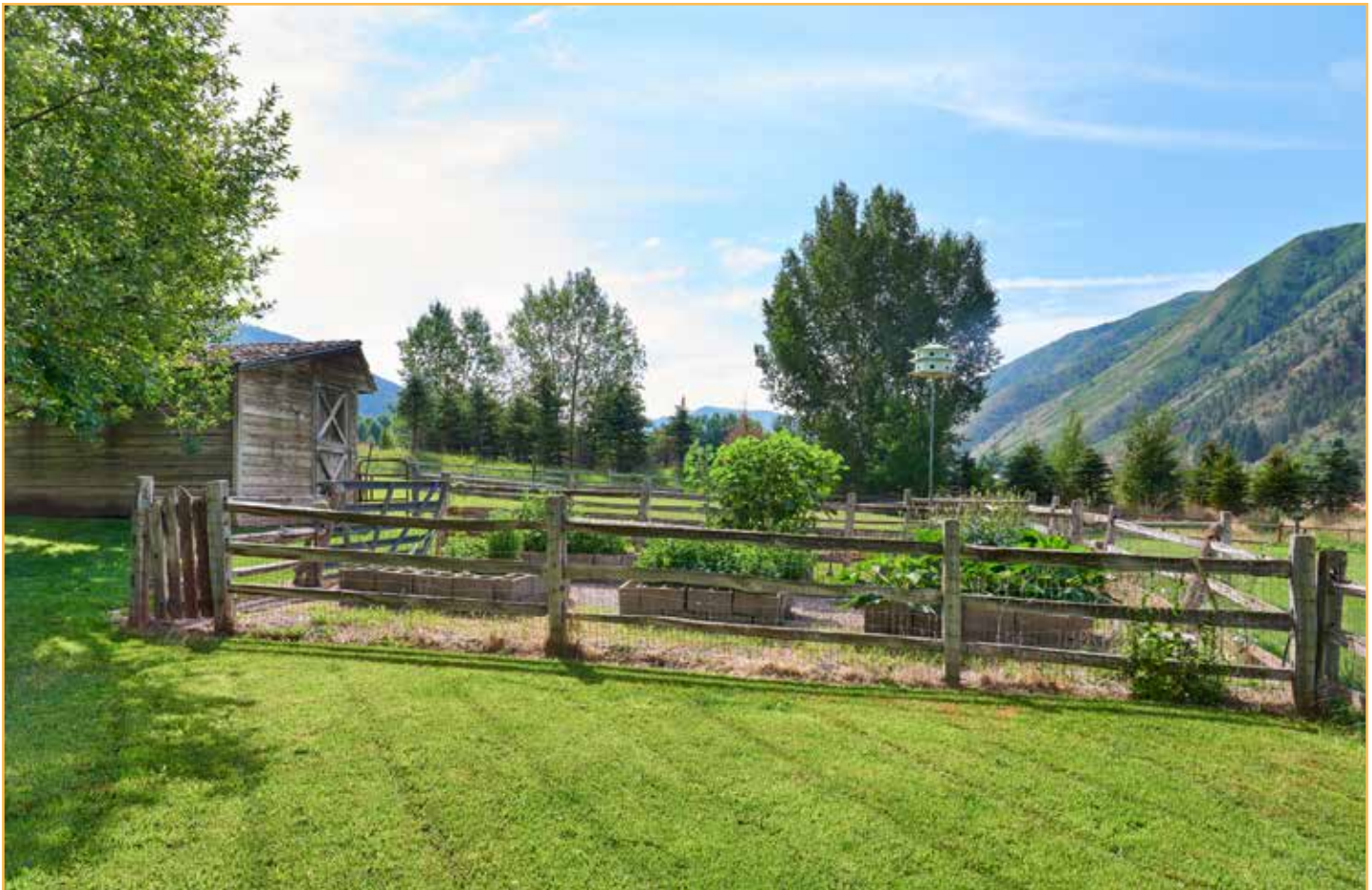
Vegetable garden and barn 15