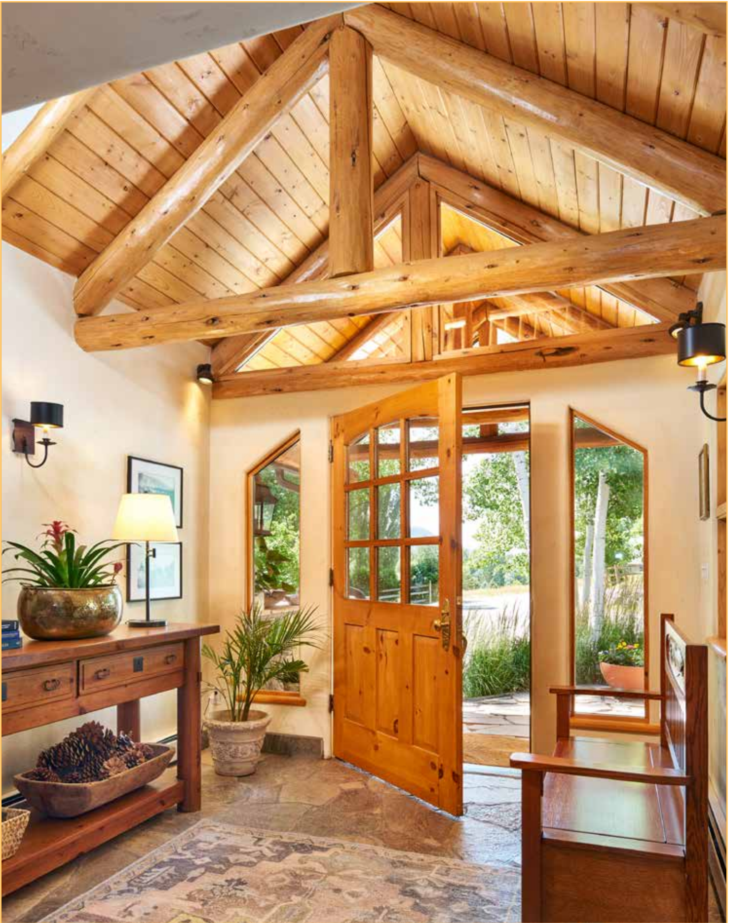
Entrance with log accents and stone floor