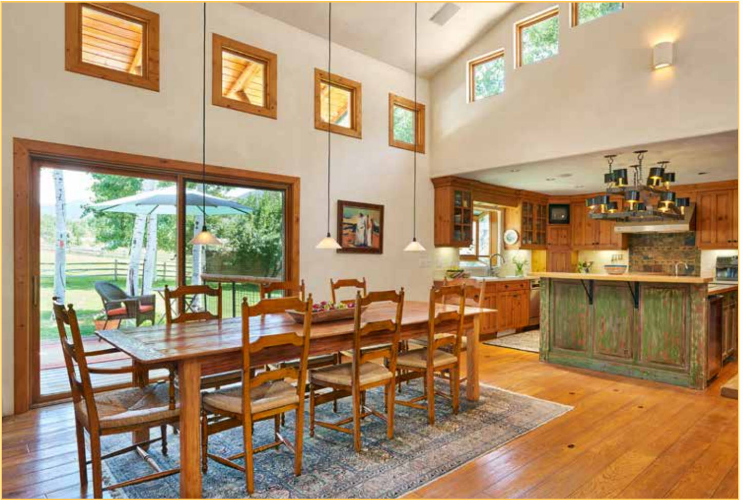
Open dining area with sliding glass doors to the patio and backyard