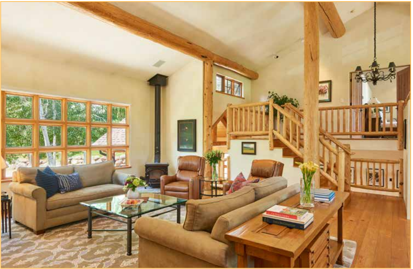
Light filled living room with cathedral ceilings