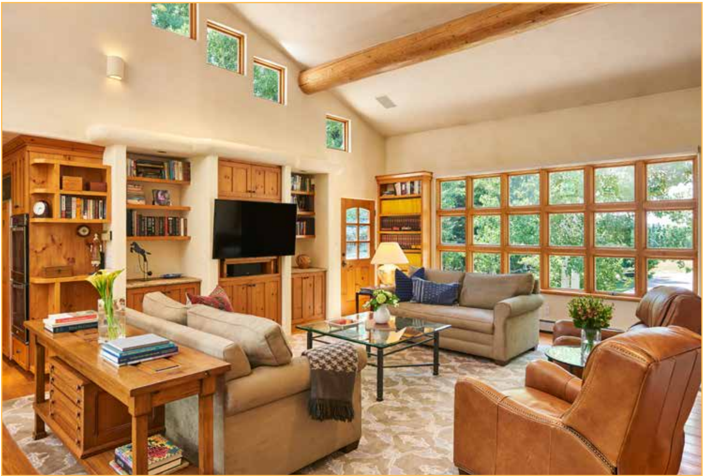
Living area has built-in cabinets and shelving