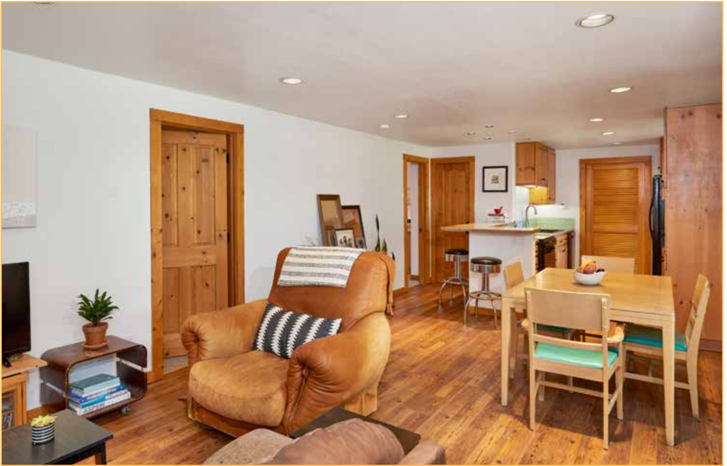
Living and kitchen area, bedroom and bath in mother-in-law unit