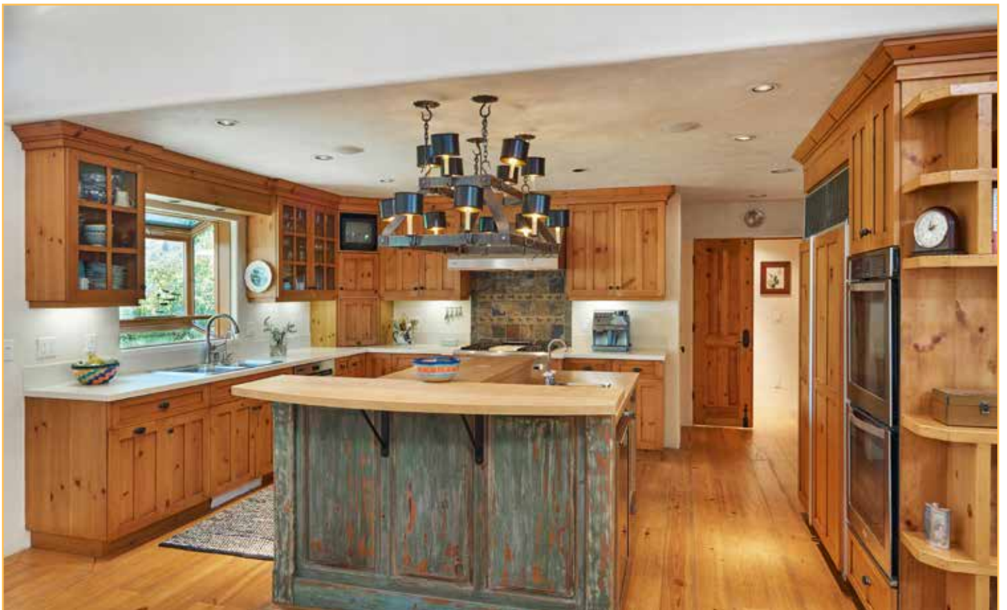
Spacious chef's kitchen with large center island