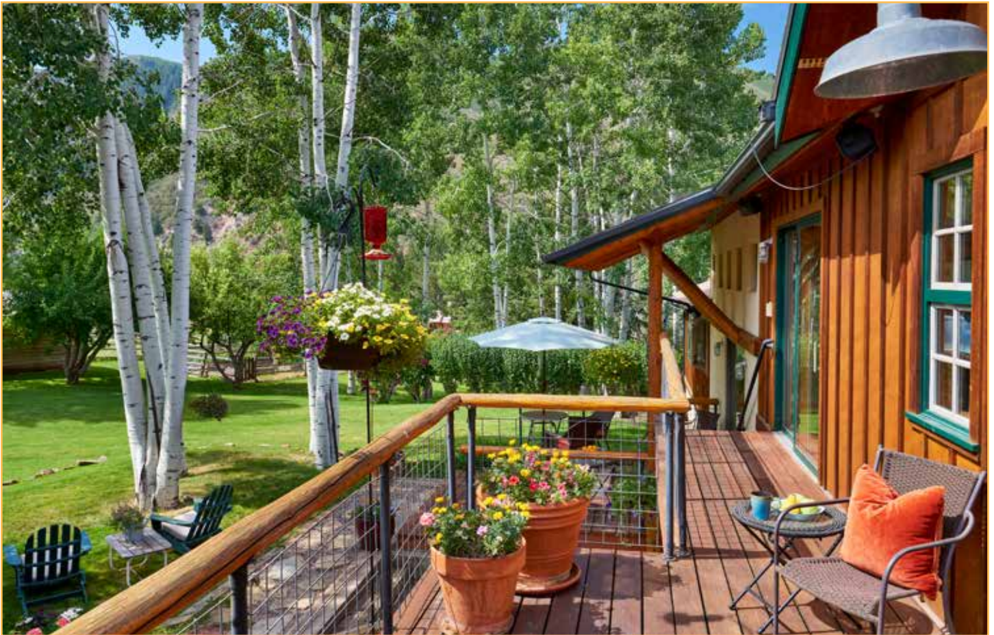
Deck off of master bedroom