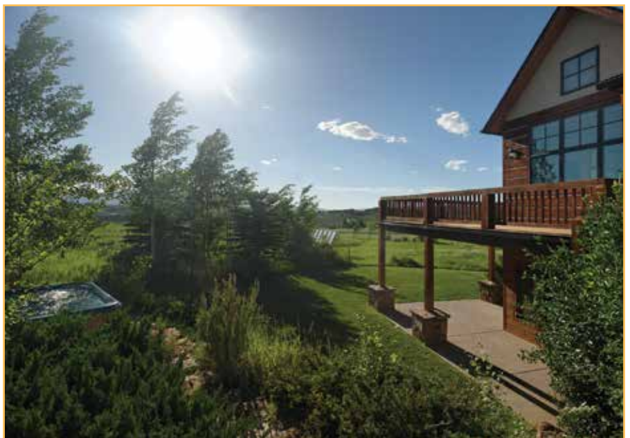
Views looking west