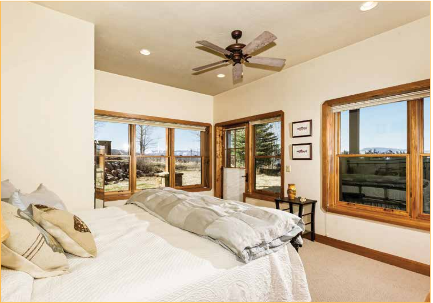
Walkout level guest bedroom