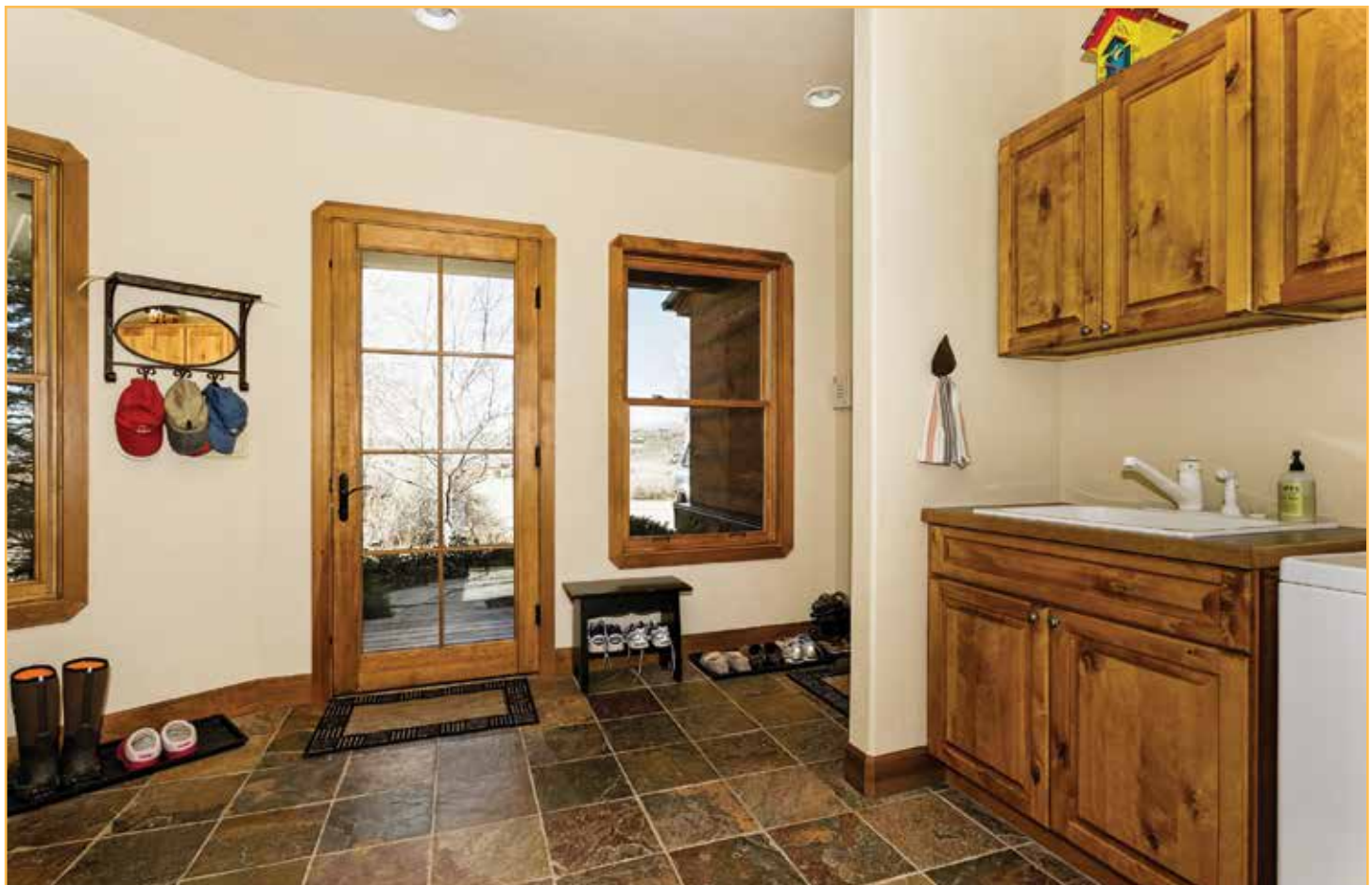
Large mud/laundry room with its own entrance