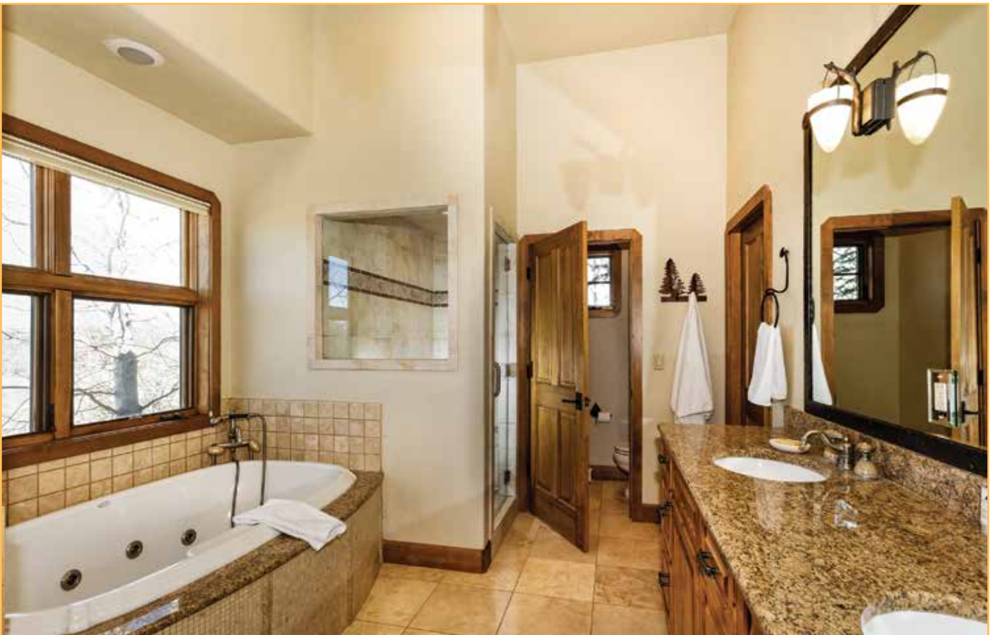
Master bath with jetted Kohler tub, steam shower and walk-in closet