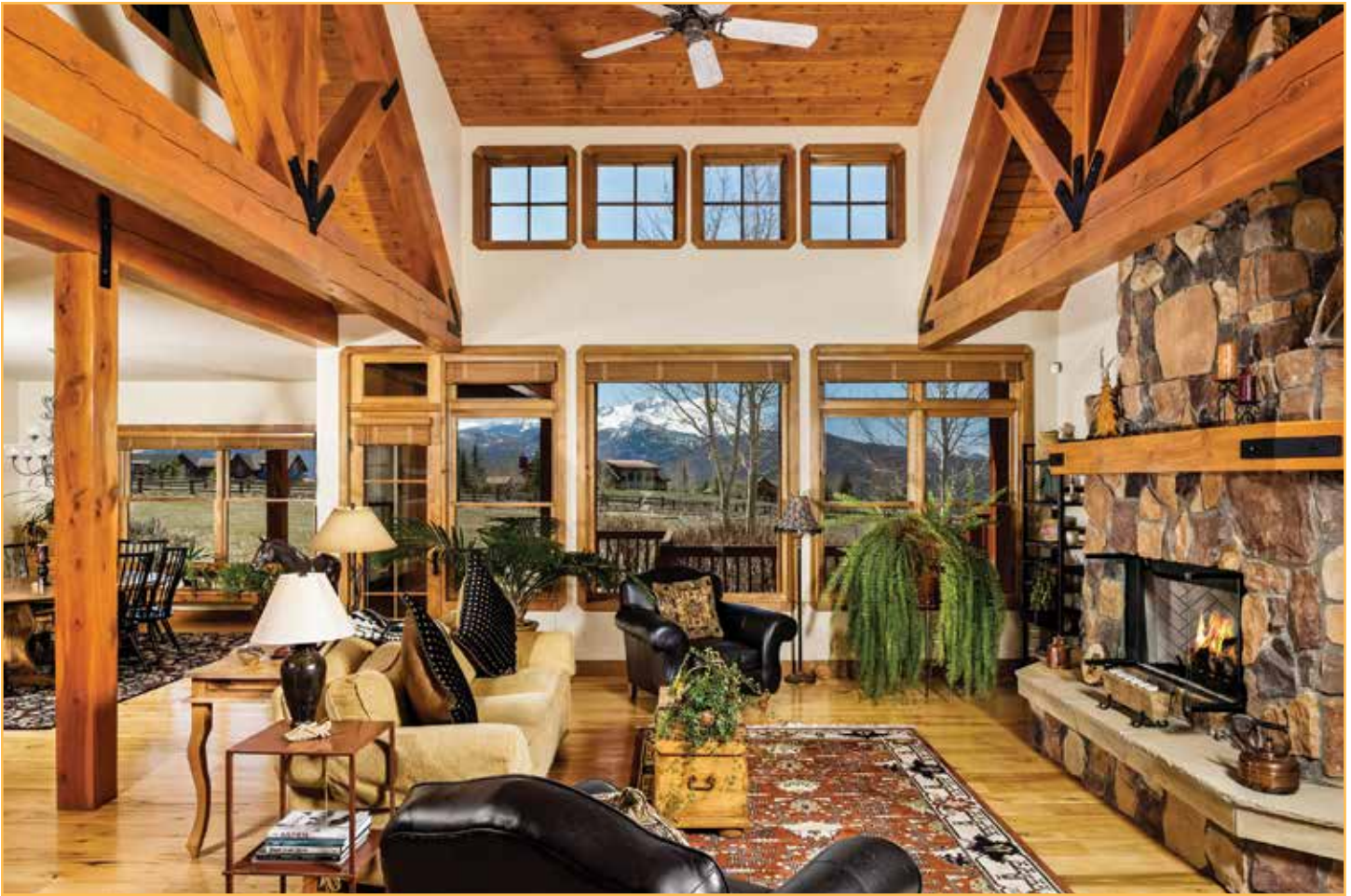
Colorado stone surrounds the great room fireplace, architectural trusses and plenty of windows