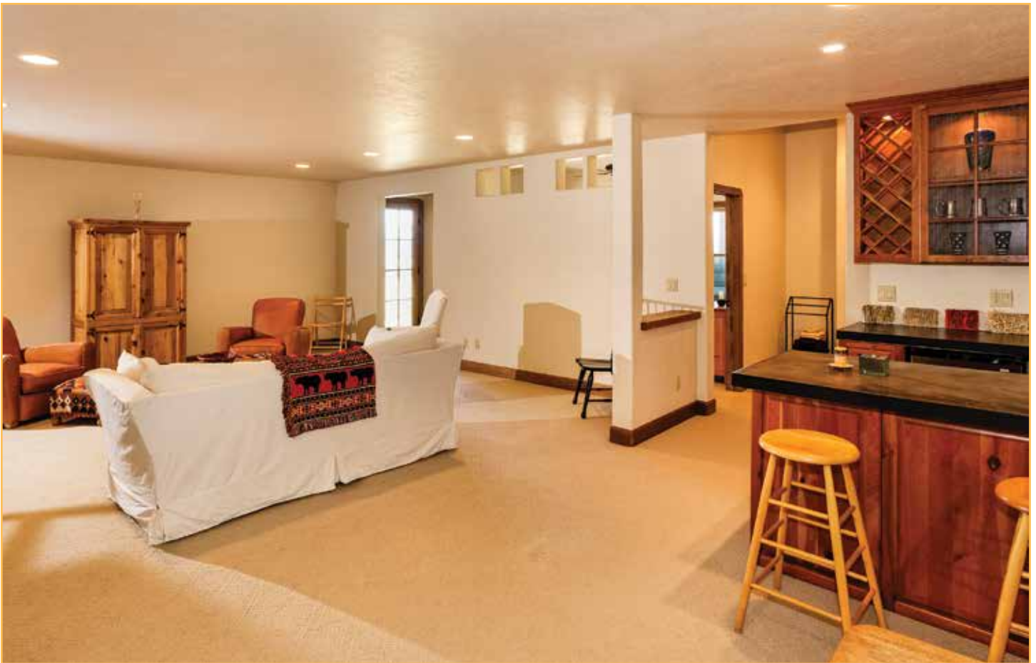
Roomy downstairs family room