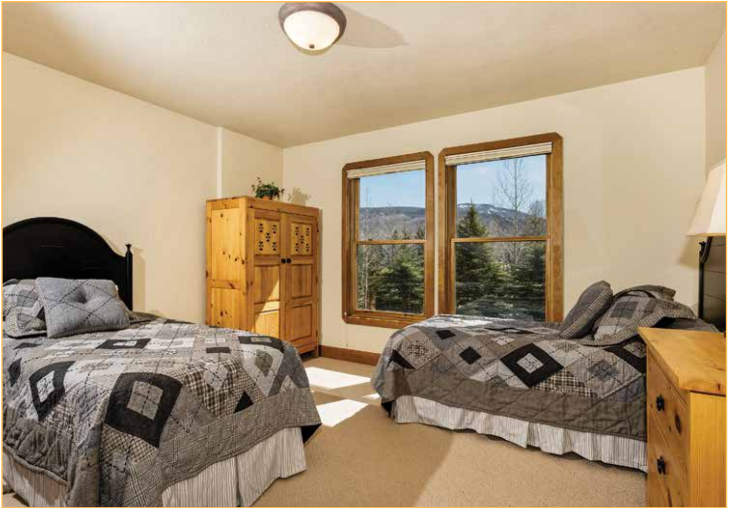
Second level guest bedroom #2