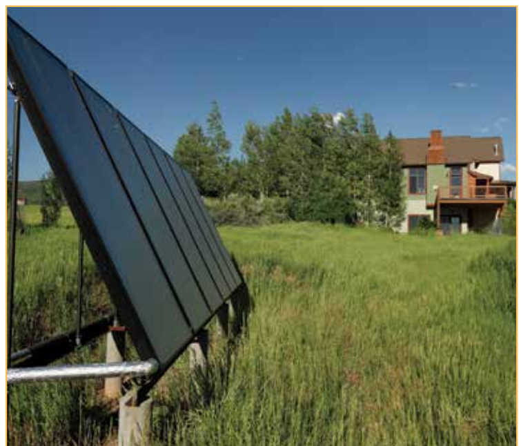
Solar panels help to supplement heat system