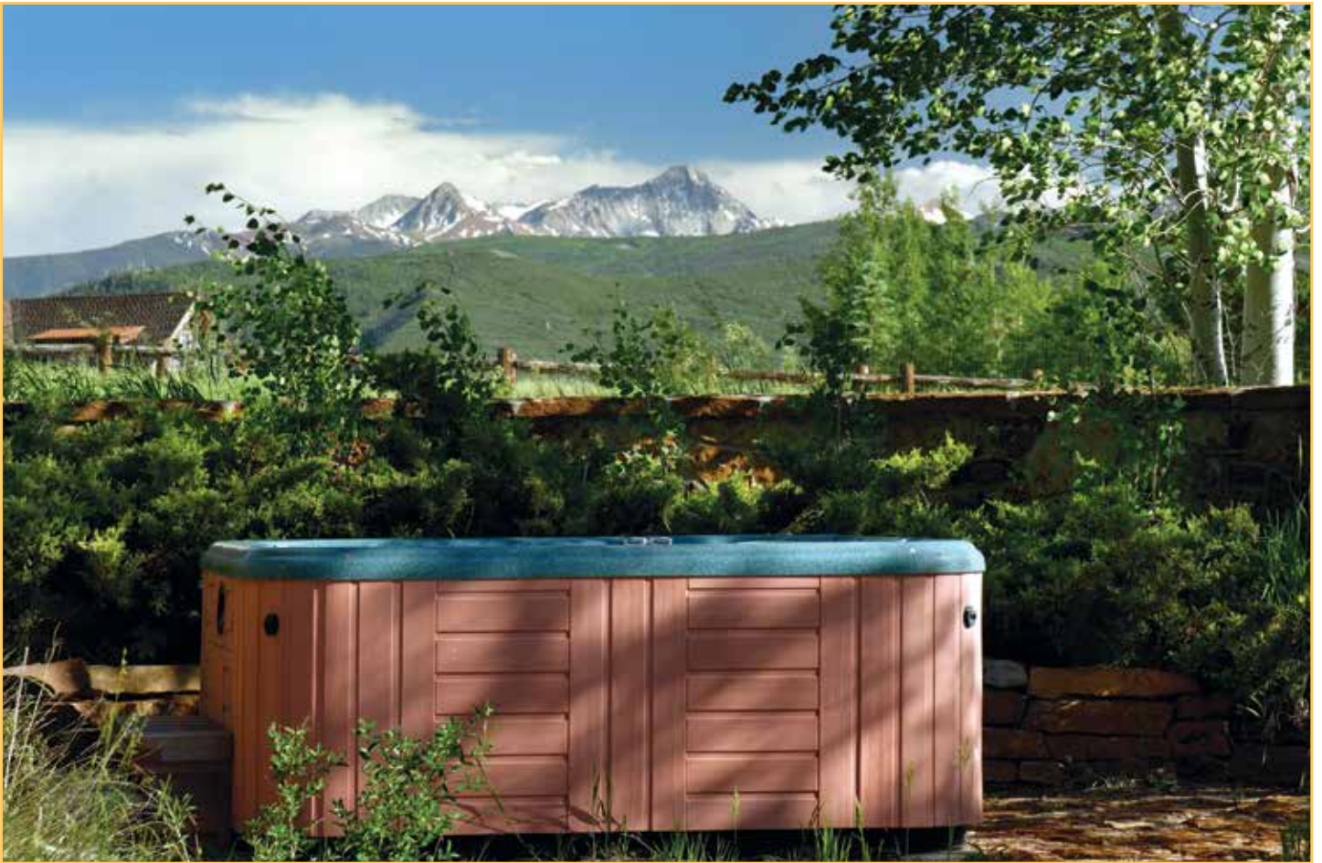
Relax and soak in the views