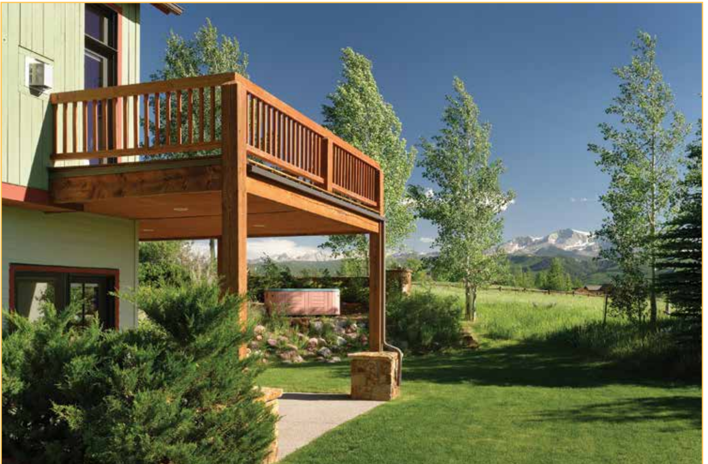
The back yard