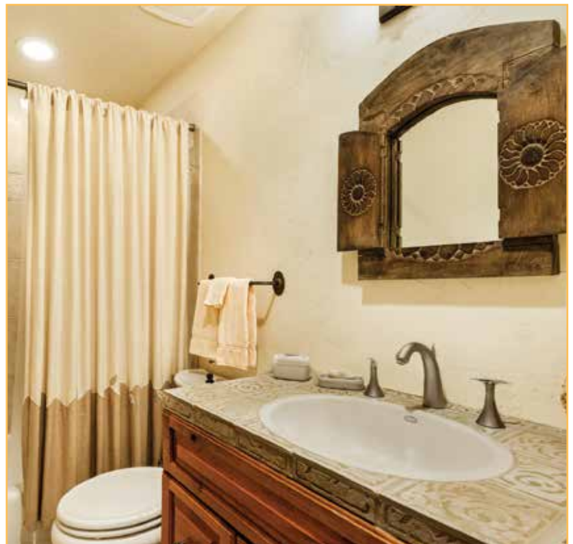
Downstairs guest bath