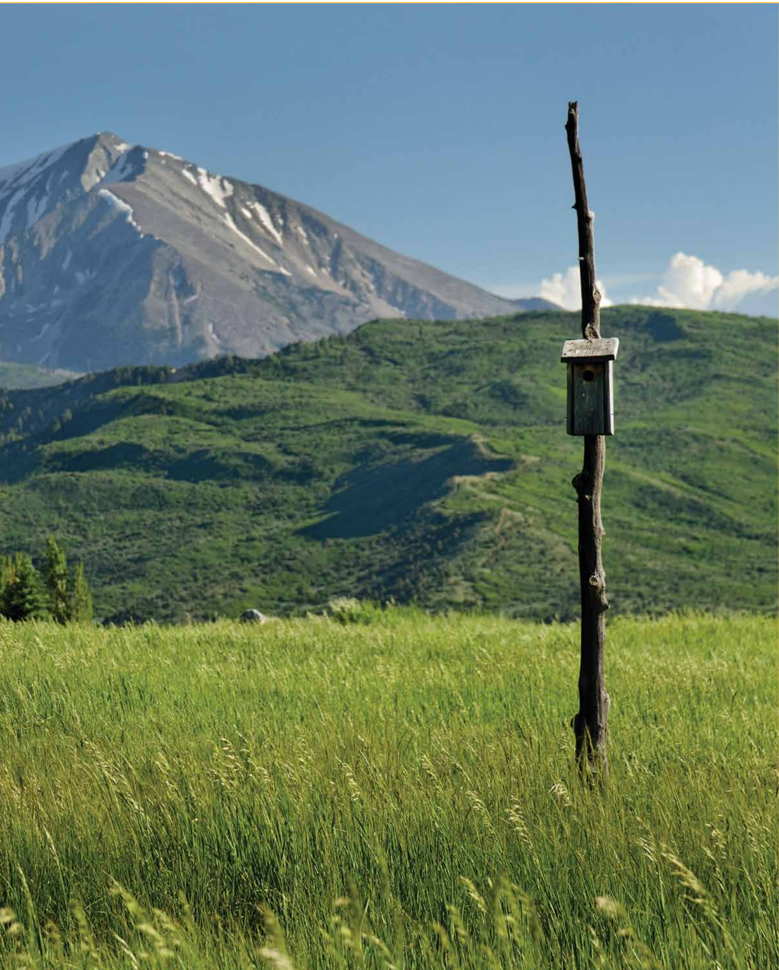
One of the many pastoral sights in the valley