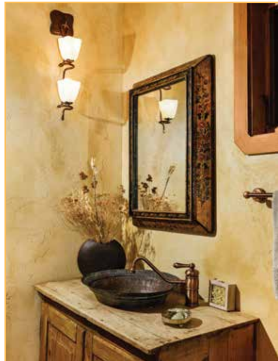
Main floor powder room