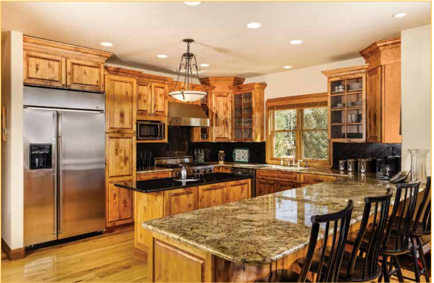
Family-sized cooks kitchen with adjacent dining area and windows all-around