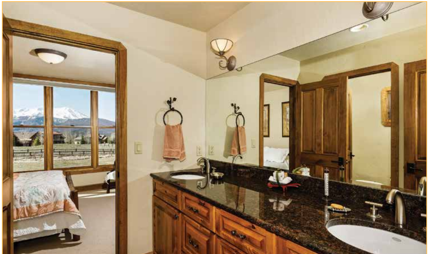
Jack and Jill bath 9