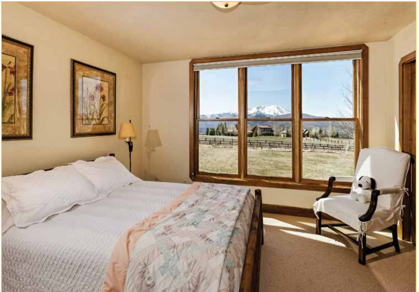
Second level guest bedroom #1