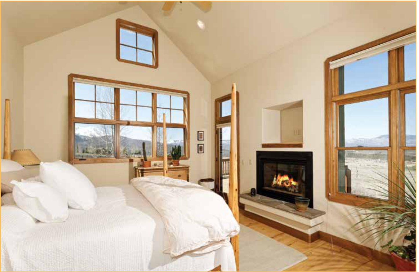
Generous master suite with gas fireplace and pillow views