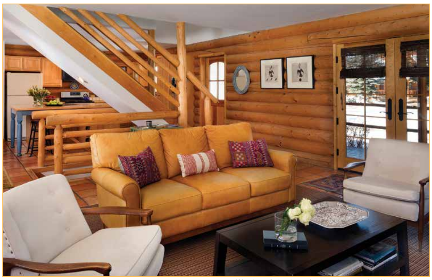
Wooden railed staircase leads to the second and lower levels