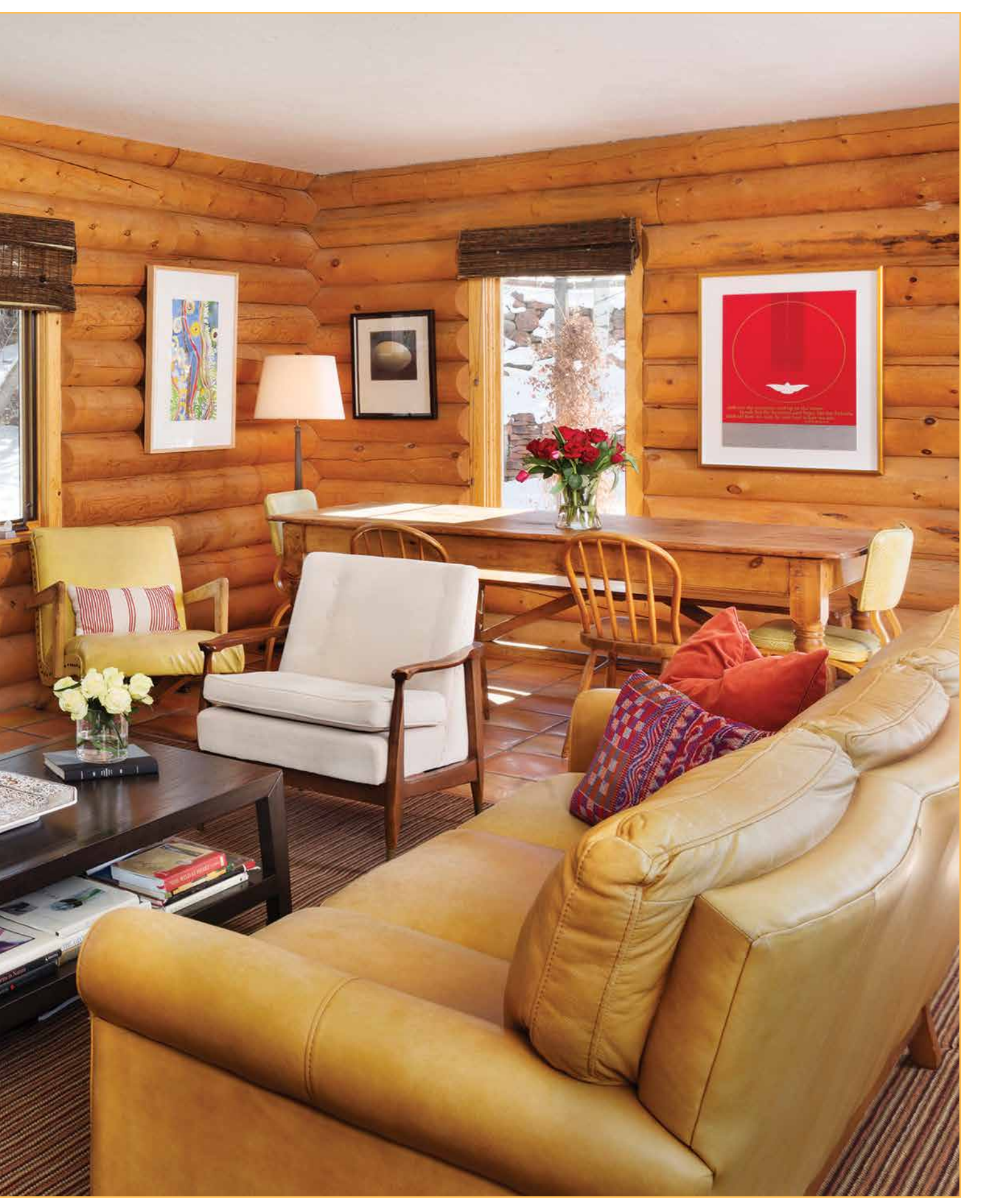
Living room with gas fireplace