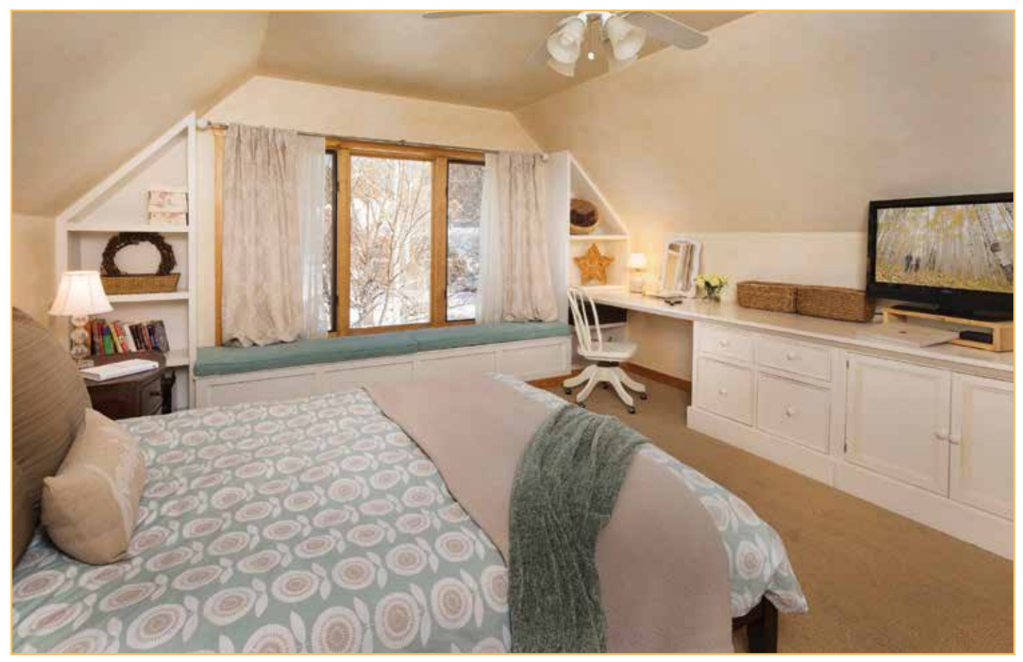
Guest bedroom with built-in cabinets and desk