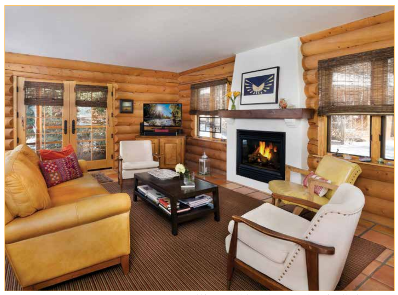
Living room with french doors to outside porch and backyard