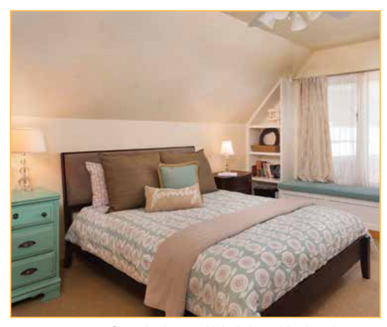
Guest bedroom with built-in cushion bench