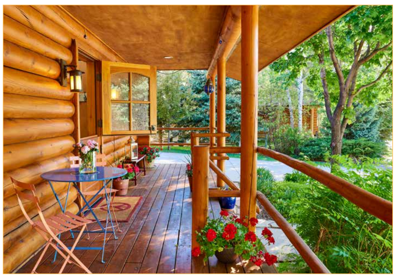
A coveted front porch