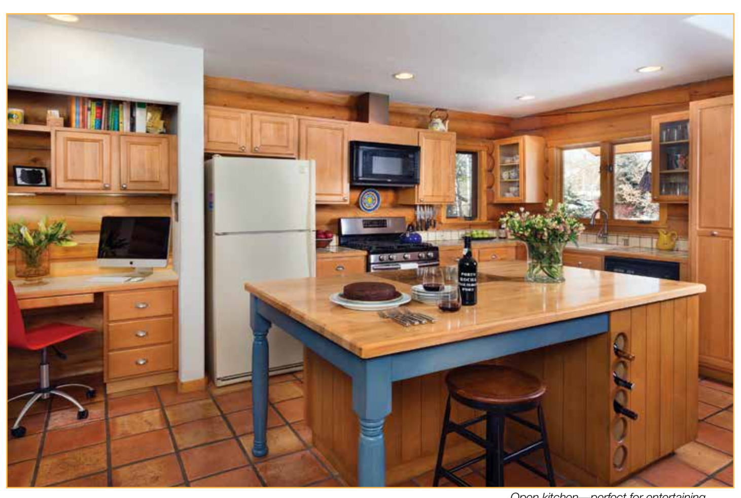
Open kitchen—perfect for entertaining