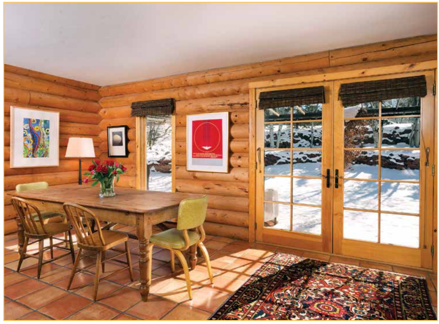
Dining area with french doors to outside patio