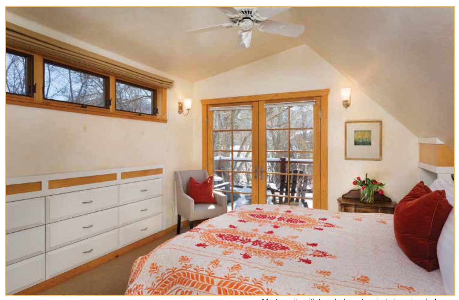
Master suite with french doors to private lounging deck