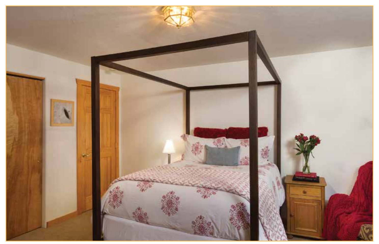
Lower level guest suite