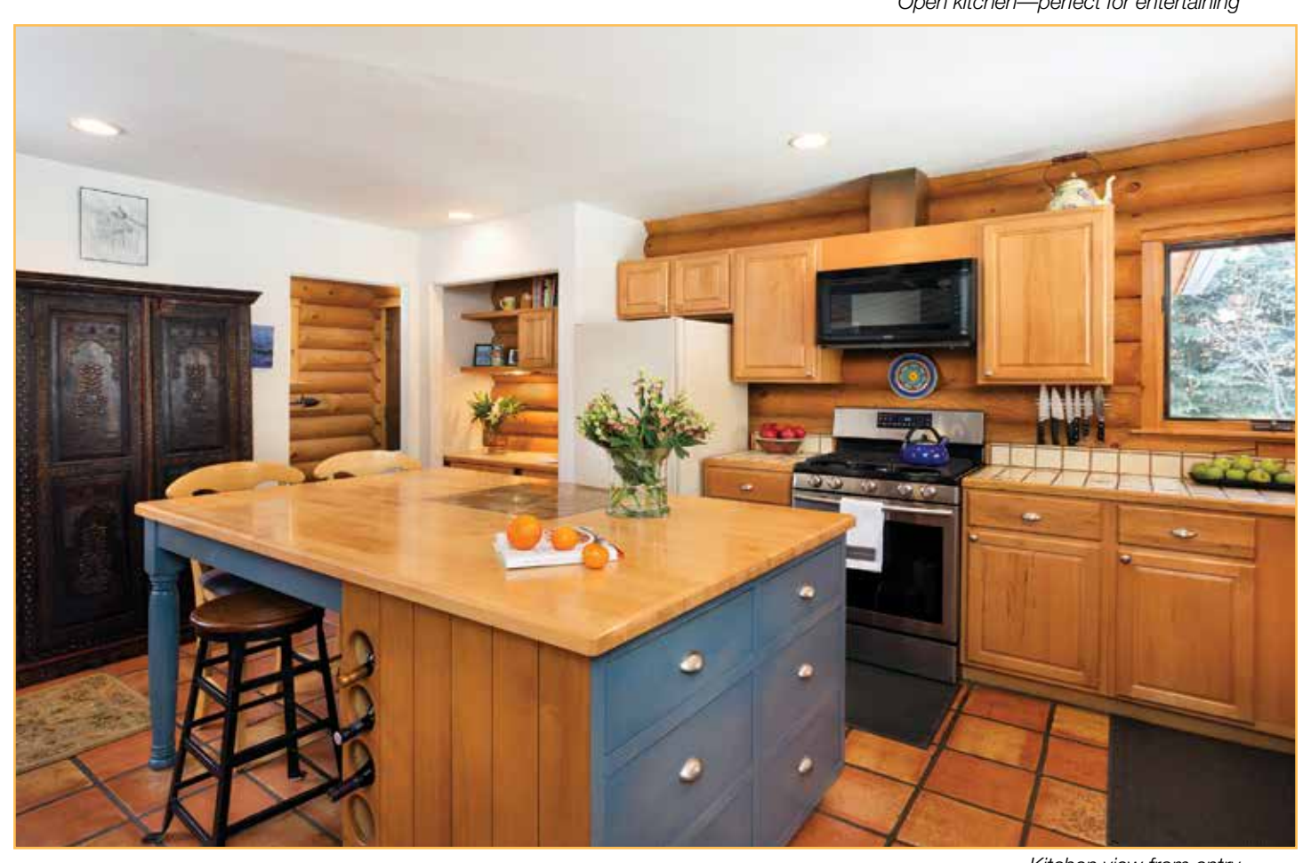
Kitchen view from entry