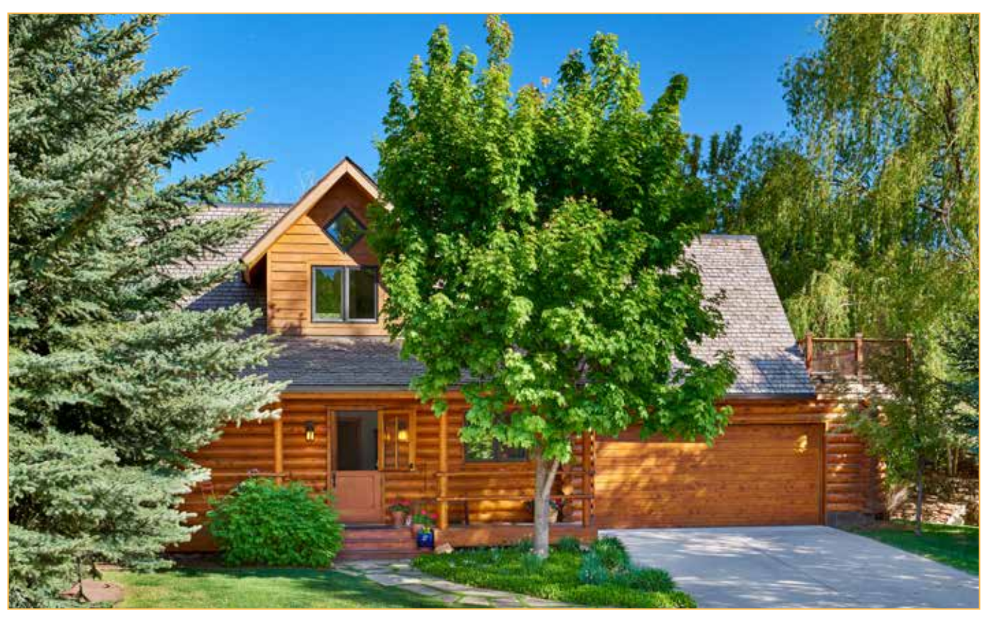
Tucked back in the trees