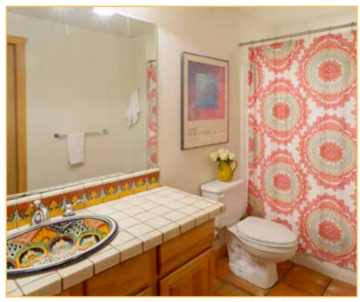
Lower level guest suite bathroom