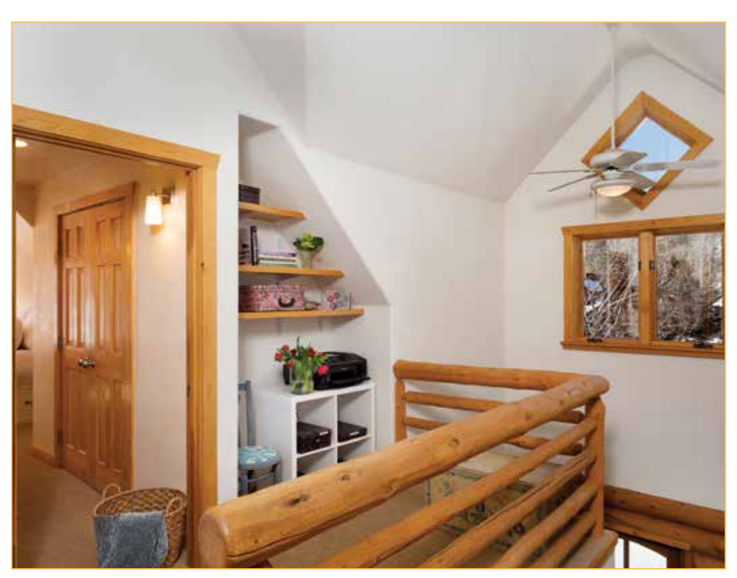
The second level landing—space enough for a desk and chair