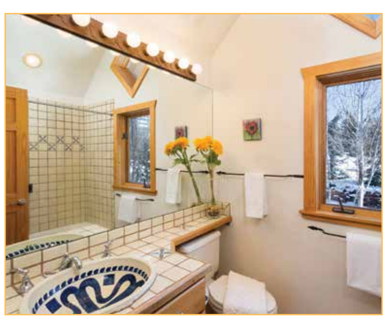
Guest bedroom bathroom