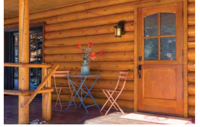
Warm and inviting front door