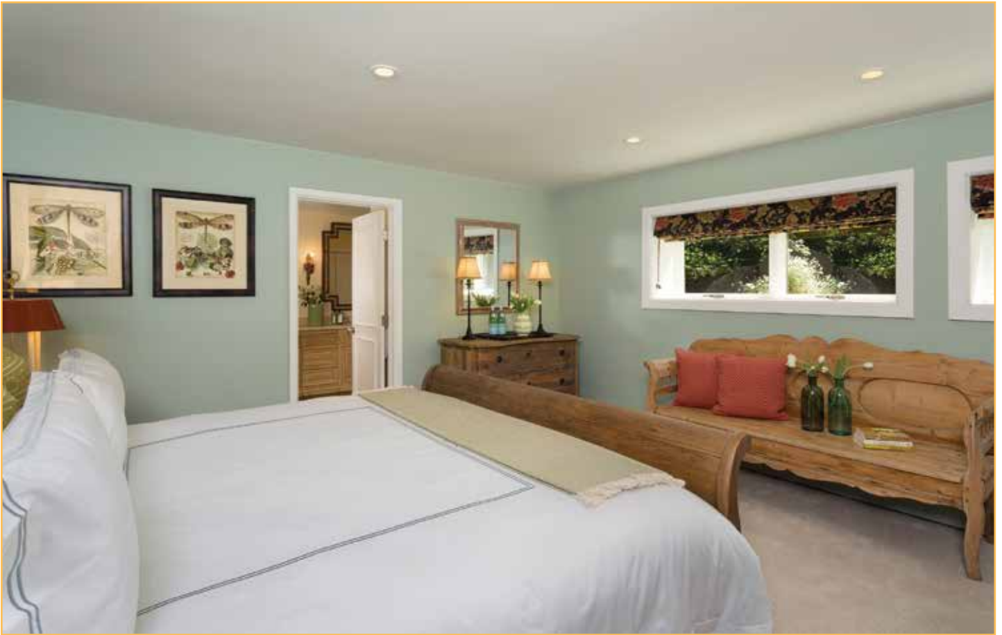
Garden level guest master suite with glass door to outdoor hot tub