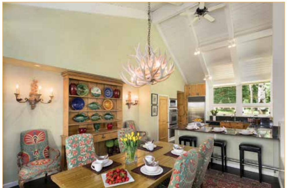
Walk-in pantry and back door to yard off kitchen