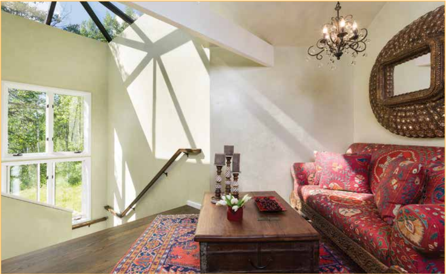
Light filled atrium and reading area