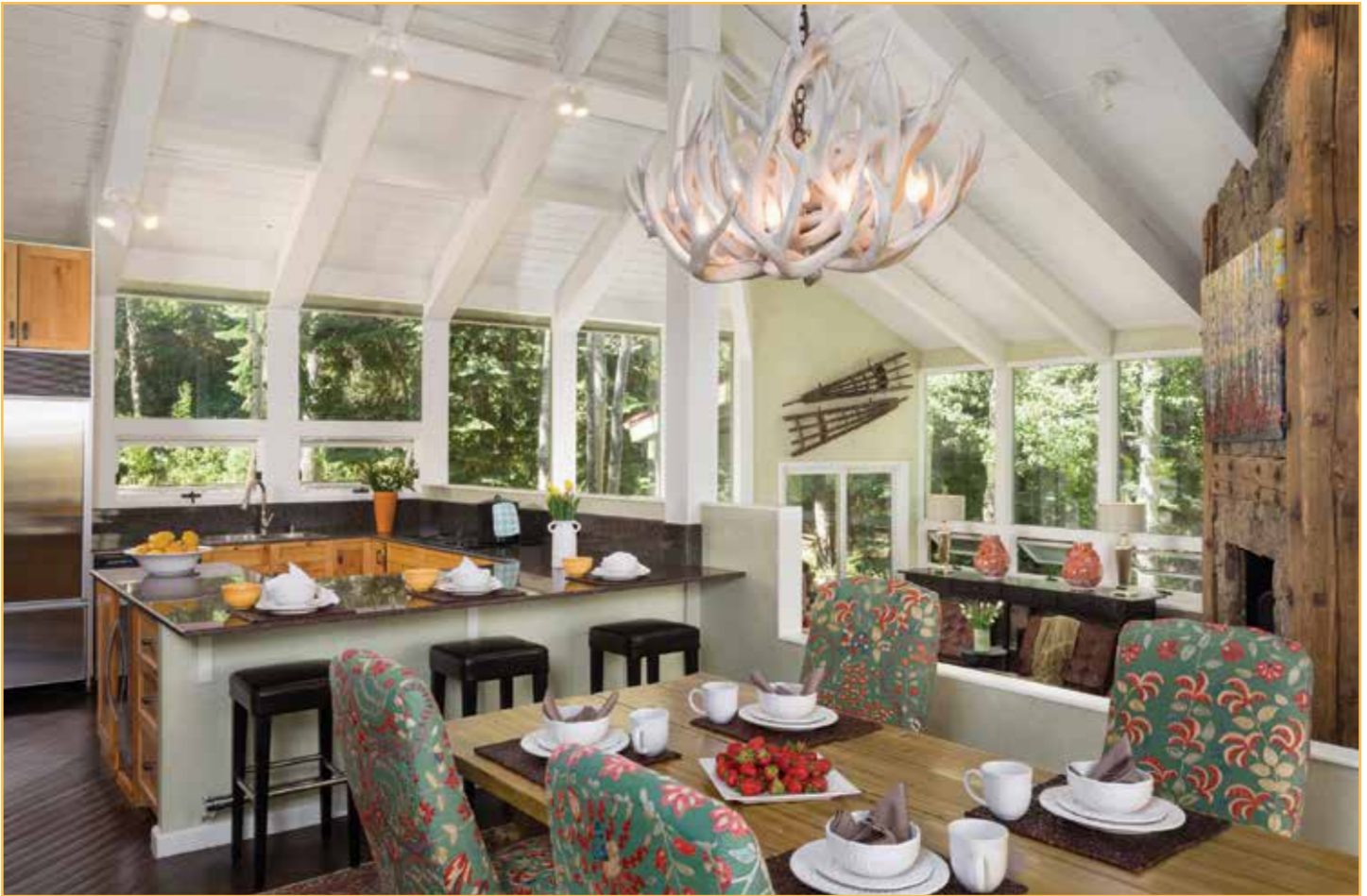
Open dining and kitchen areas overlook the great room