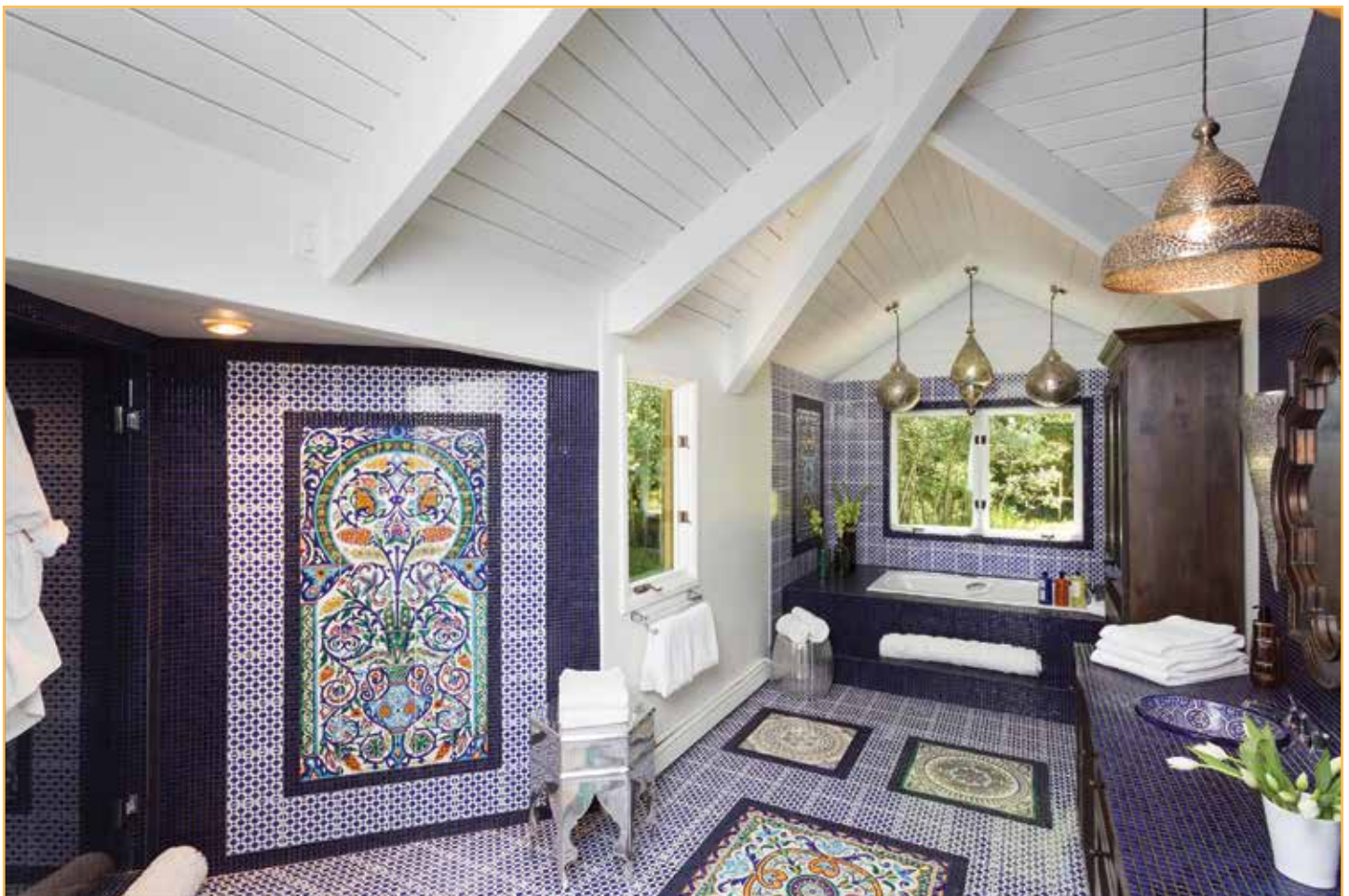
Extraordinary tiled master bath with vaulted ceilings, walk-in shower, separate water closet and huge closet with built-ins