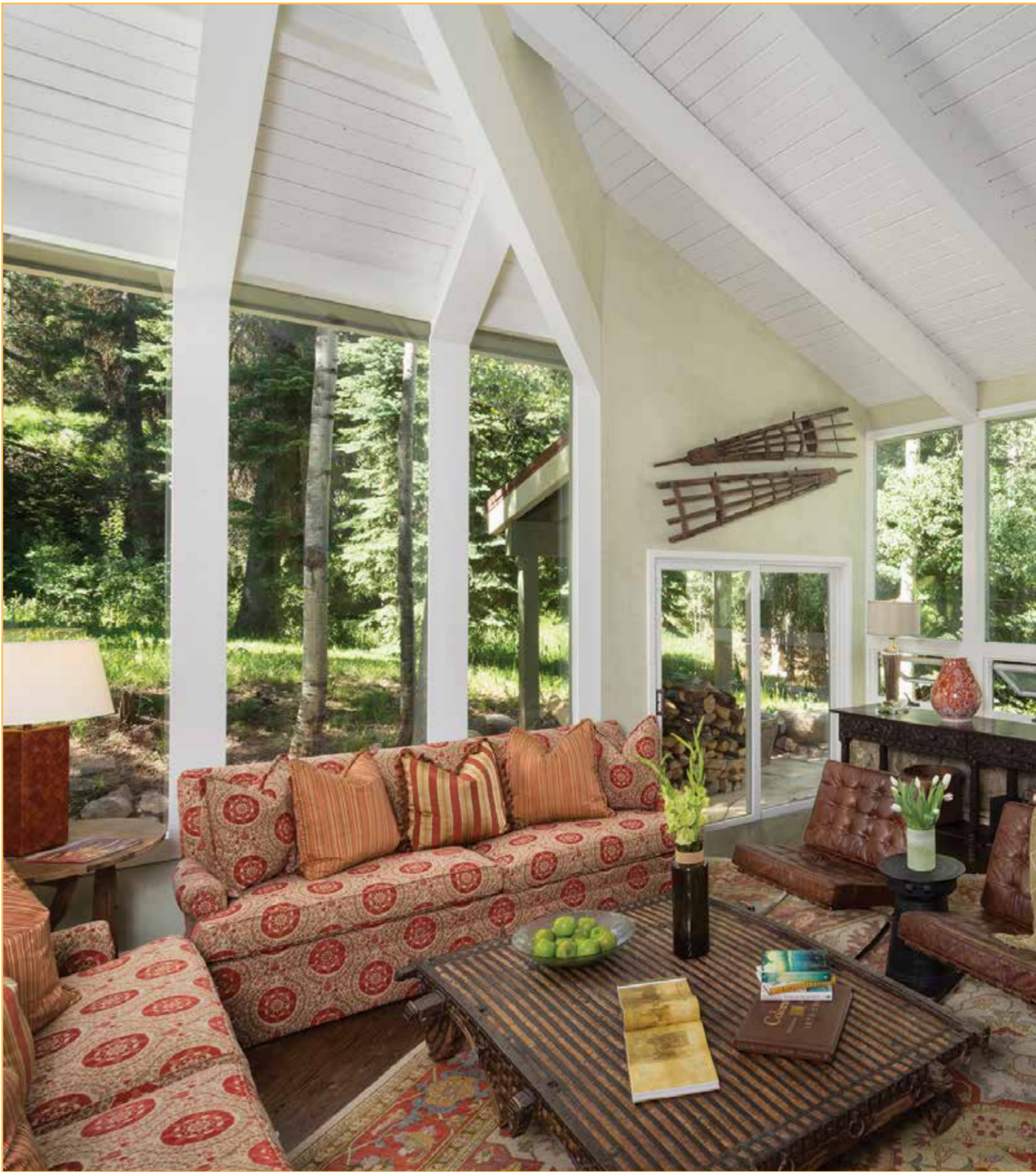
Great room with vaulted ceilings, stone fireplace and reclaimed timbers surrounded by large windows and open to kitchen and dining