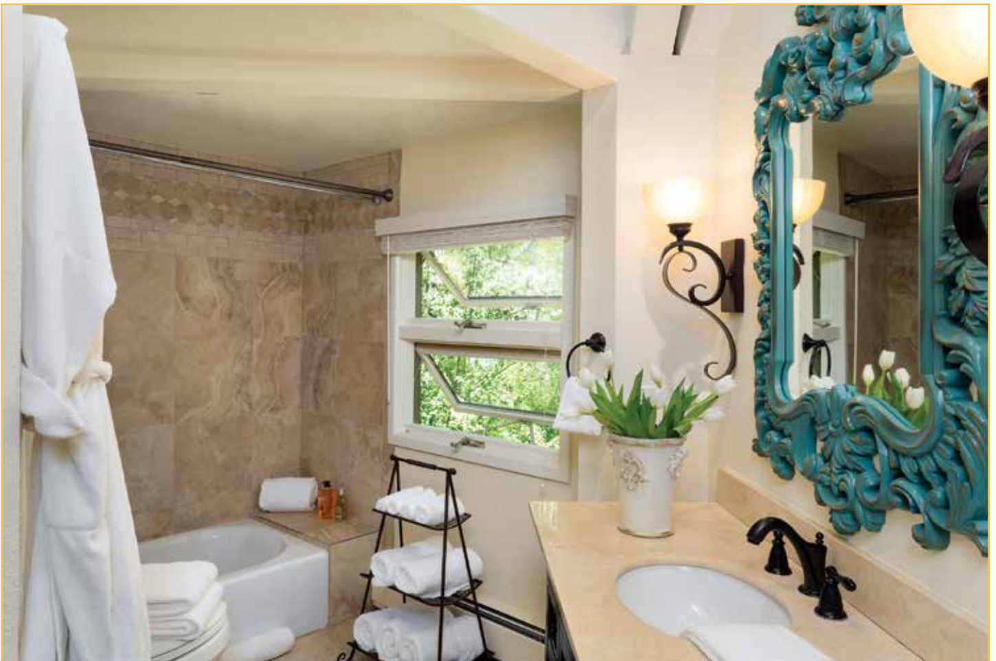
Adjoining guest bath connected to the guest bedroom pictured above.