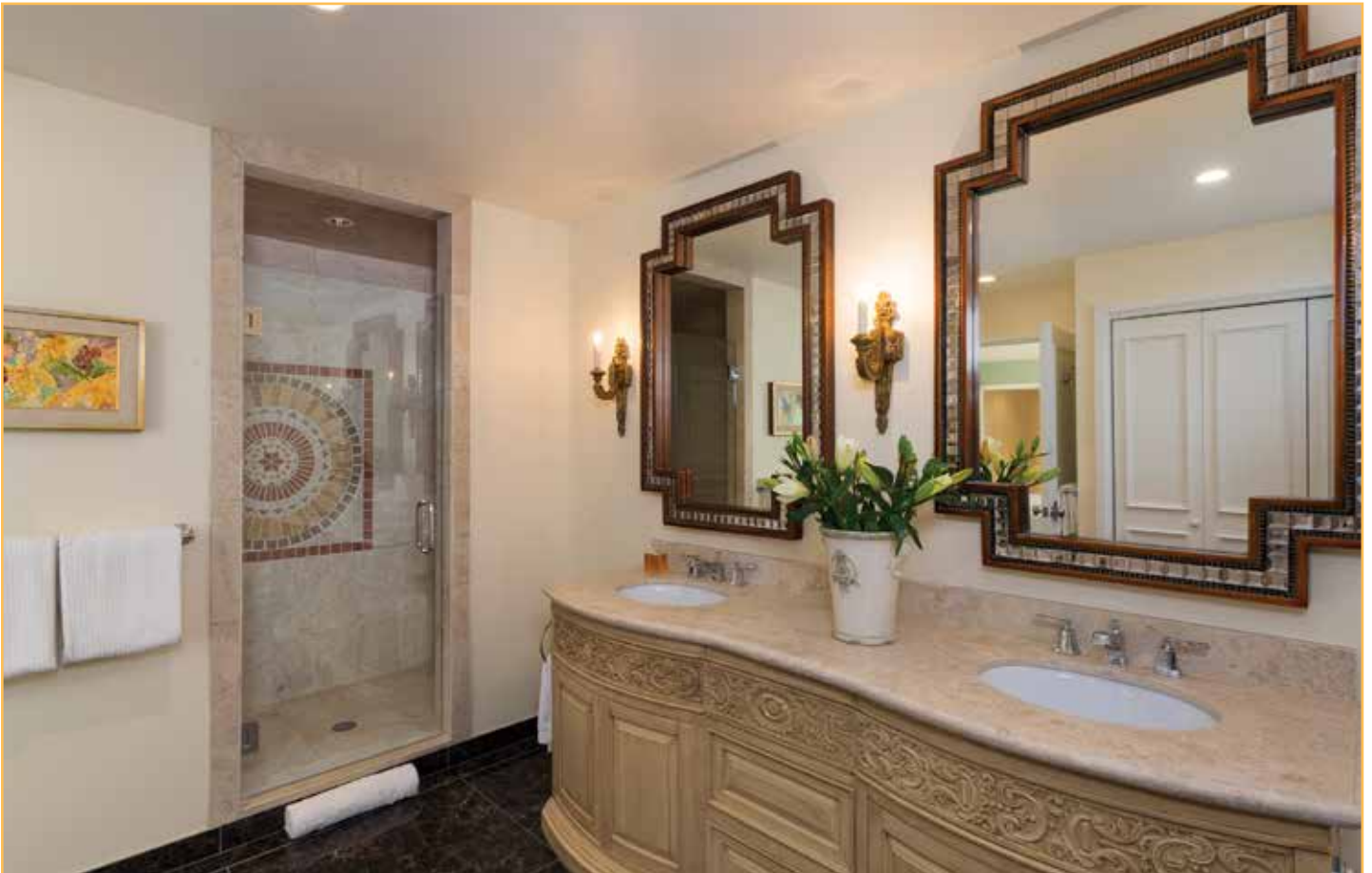
Guest master bath connected to garden level suite above is highlighted by a beautiful carved wood vanity with travertine top and a generous travertine tile shower with a stone tile art accent. There is a separate water closet and clothes closet.