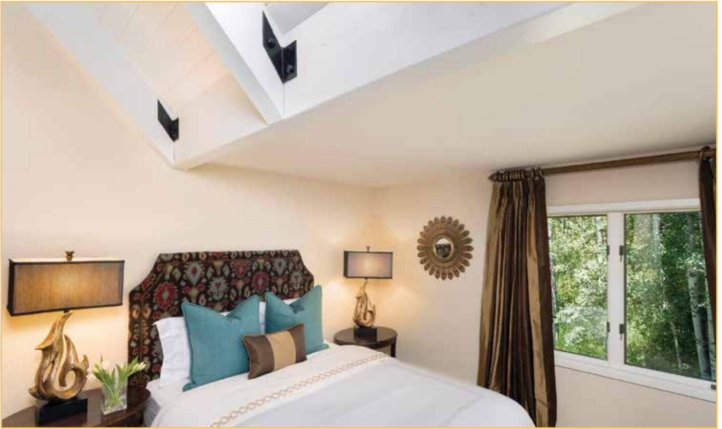
Step up to yet another guest bedroom with forest view, luxurious soft carpeting, and a partial vaulted ceiling. Situated close to the master, could be ideal for a nursery or private office.