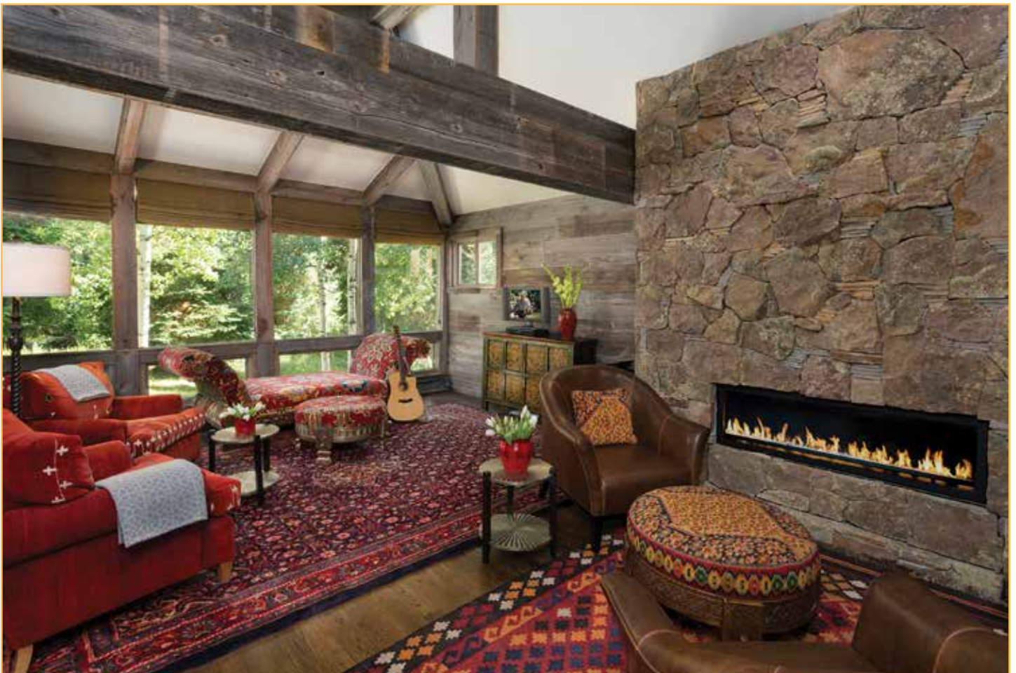
Upper level family/TV room has a gas fireplace with Colorado stone surround, reclaimed timbers and hardwood floors