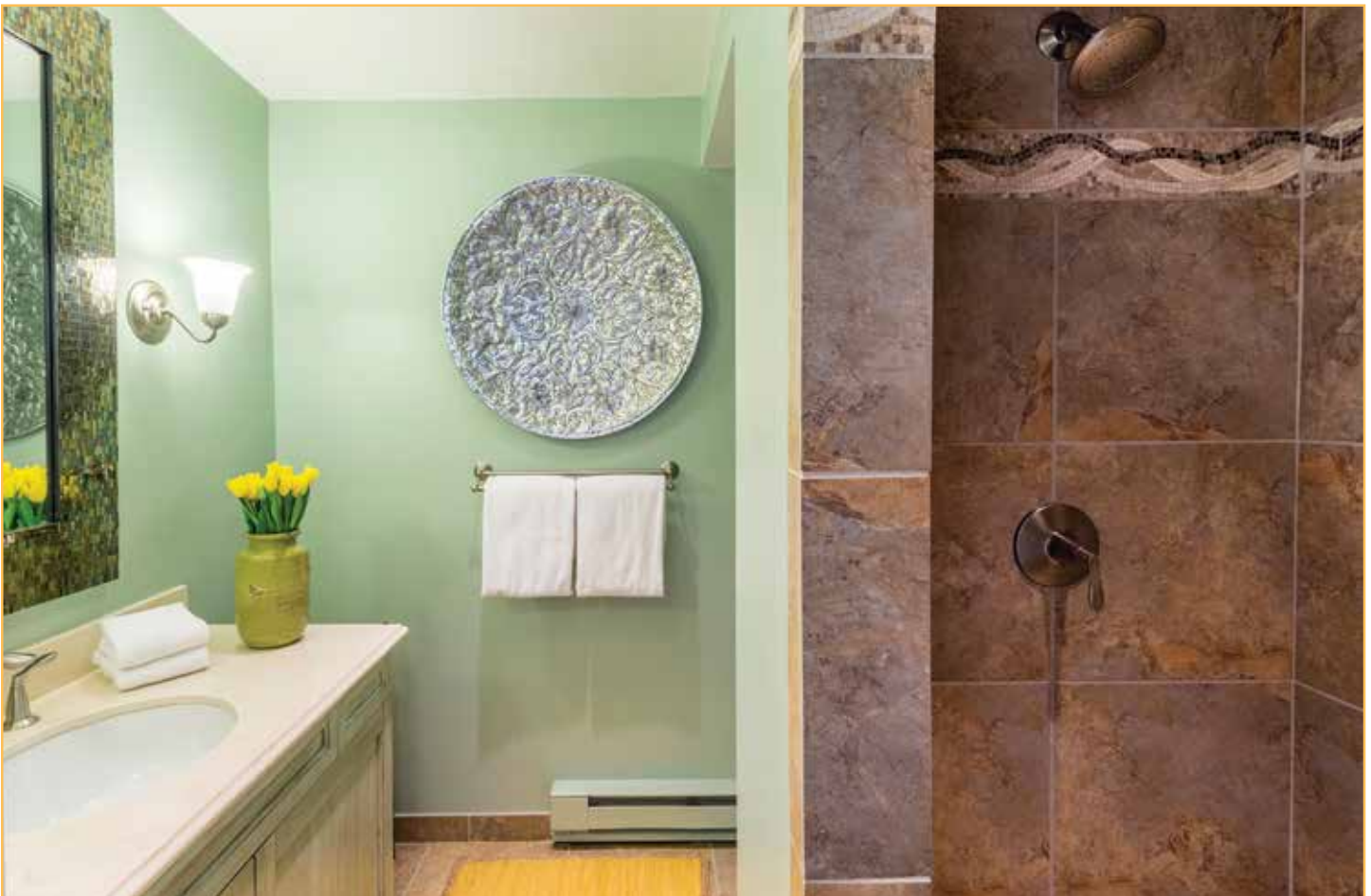
The lovely ensuite bath features ceramic tile with decorative mosaic tile accents in the shower and marble topped vanity.