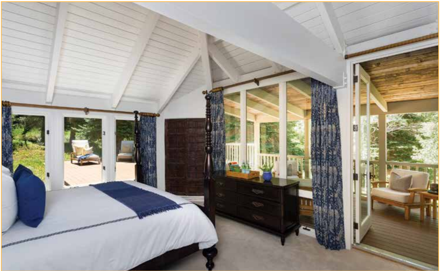
Master suite with glass doors open to a covered deck and sunny morning yoga and lounging area