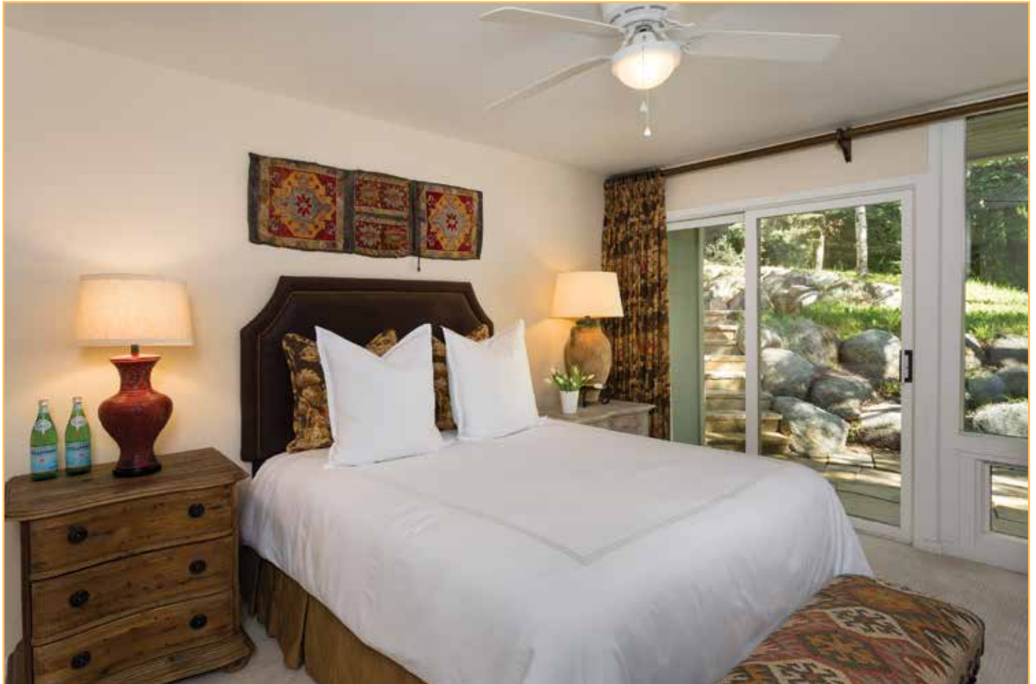
Main level guest bedroom with bath on hall