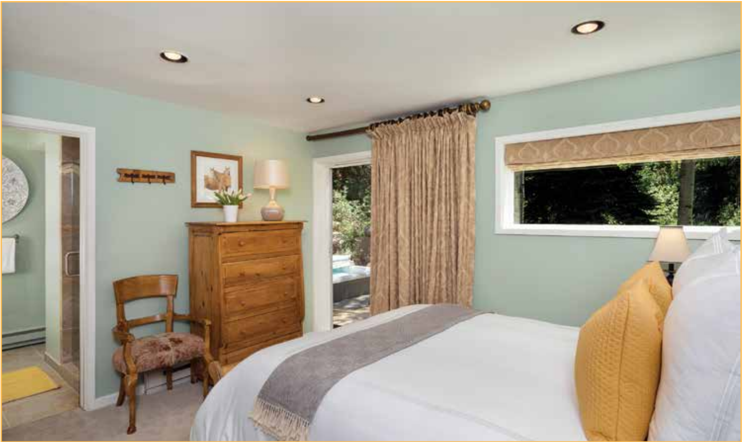
Residing on the lower level, this light and airy guest bedroom ensuite has windows and glass doors to the natural wood setting and hot tub patio.