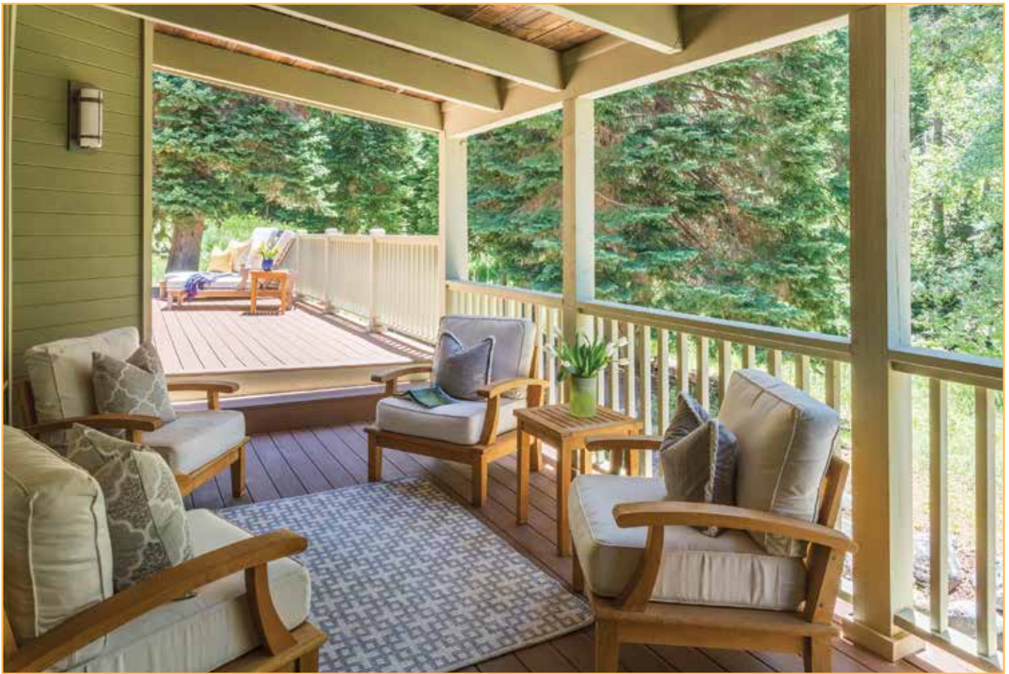
Covered deck and lounging area connected to the master suite