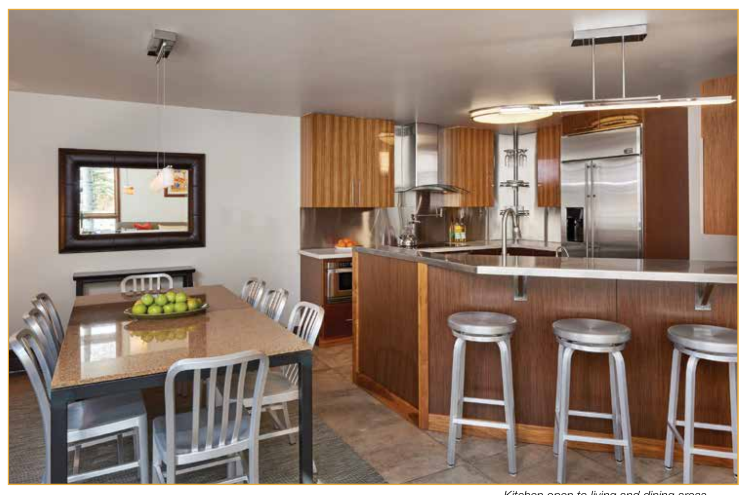
Kitchen open to living and dining areas