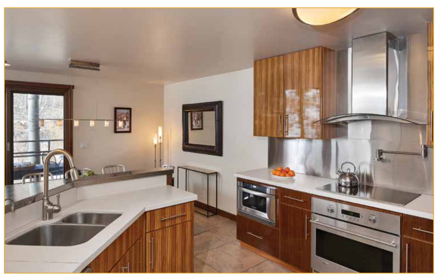
Kitchen with stainless steel appliances