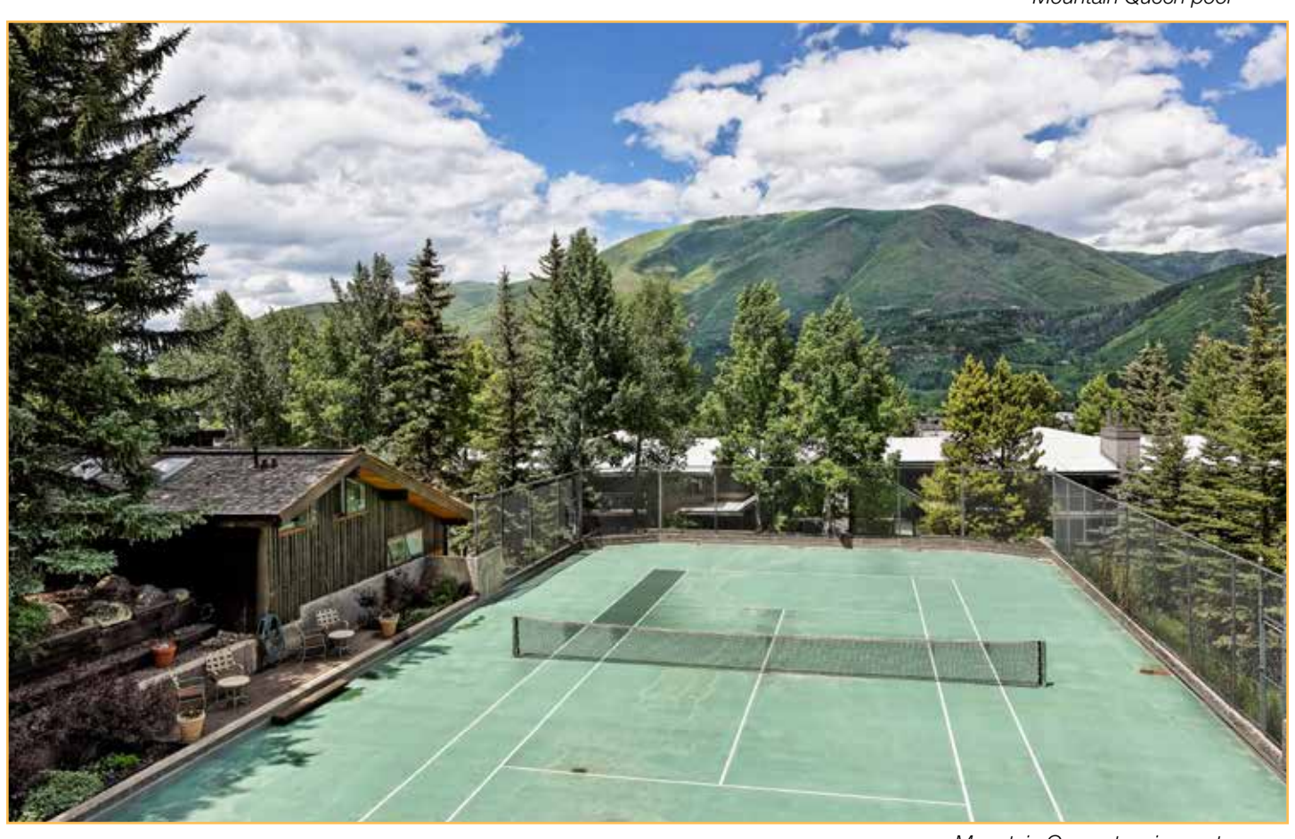
Mountain Queen tennis courts