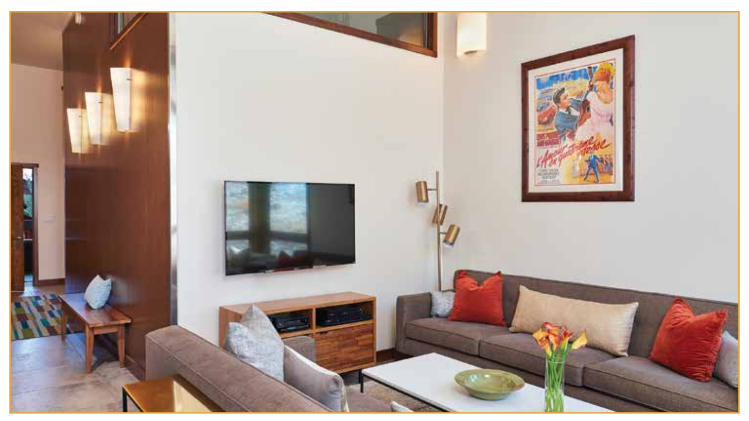
Living area open to dining and kitchen areas