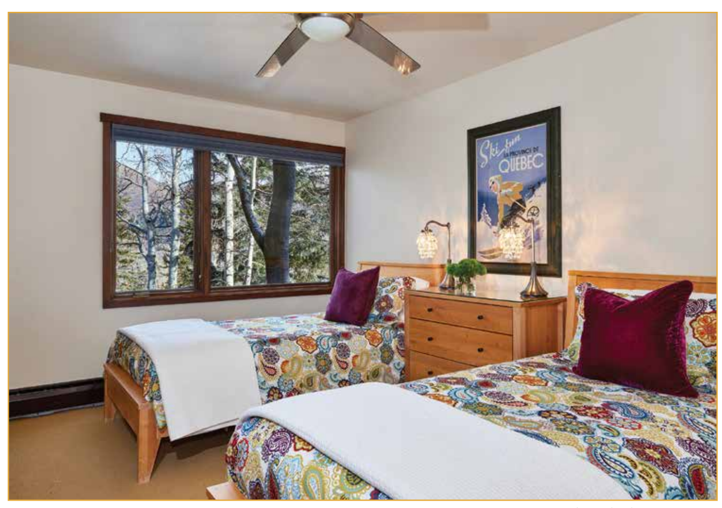
Lower level guest room