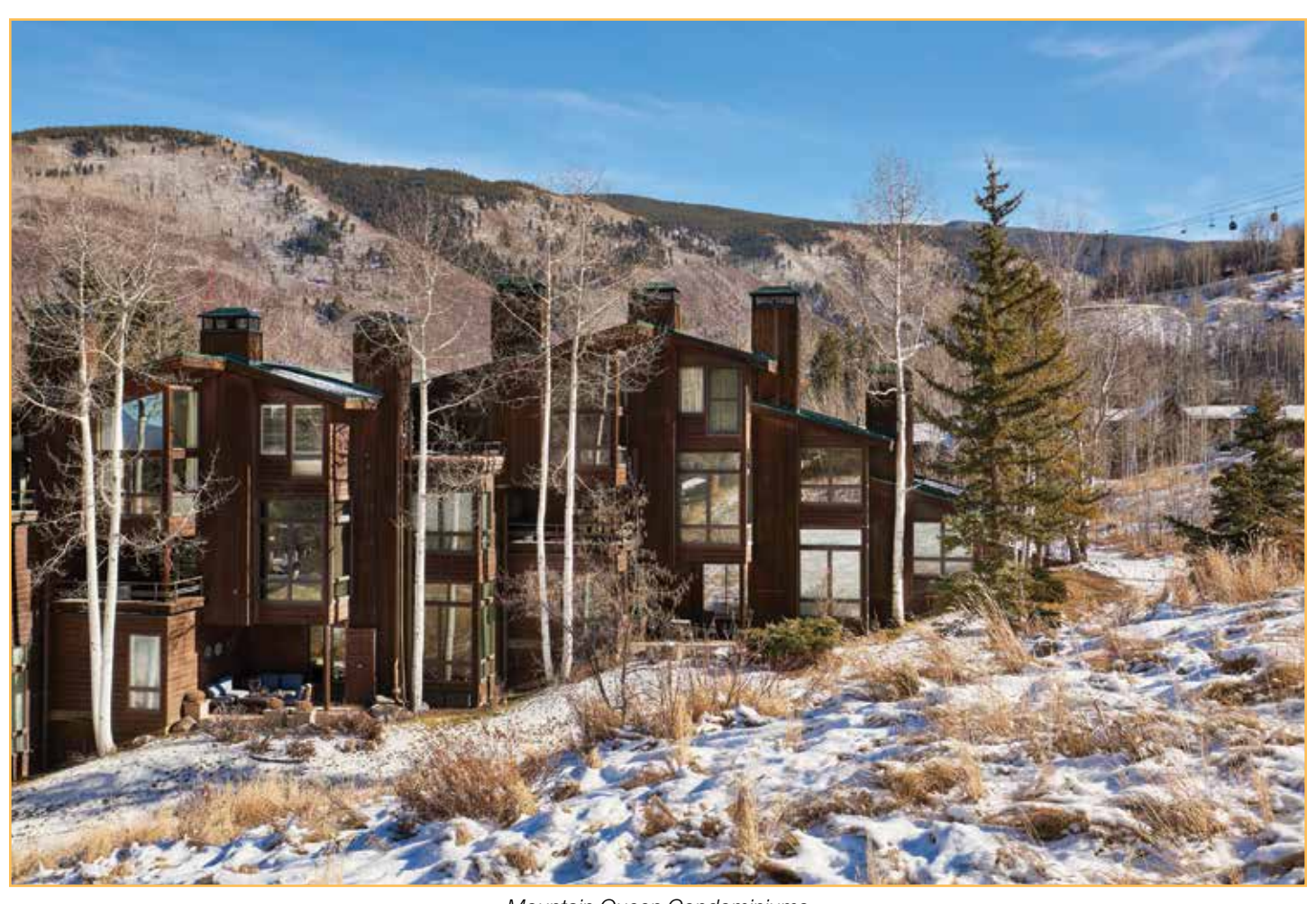
Mountain Queen Condominiums