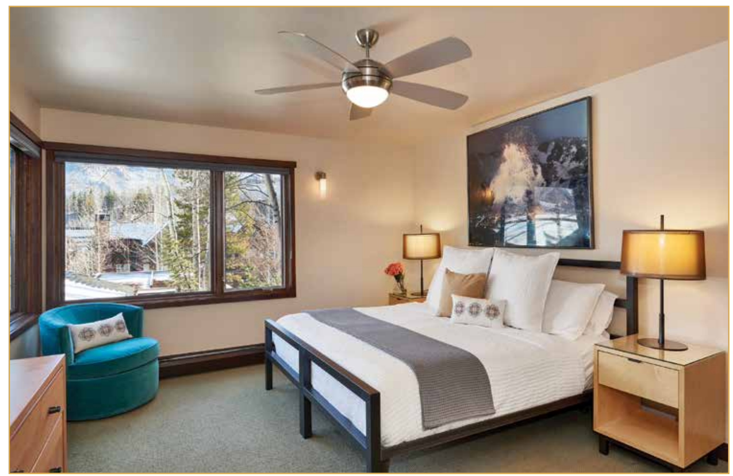
Guest master suite