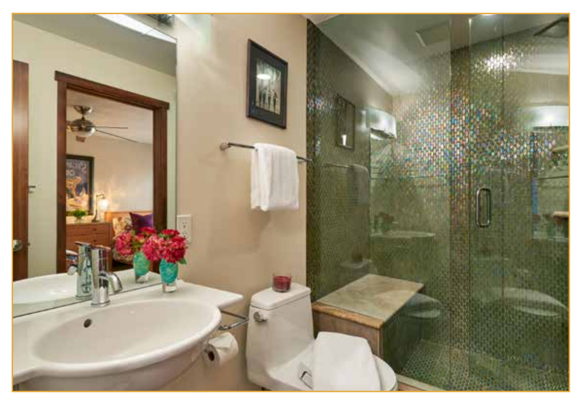
Lower level guest bath