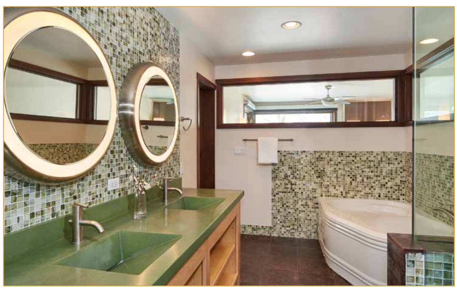
Master suite bath