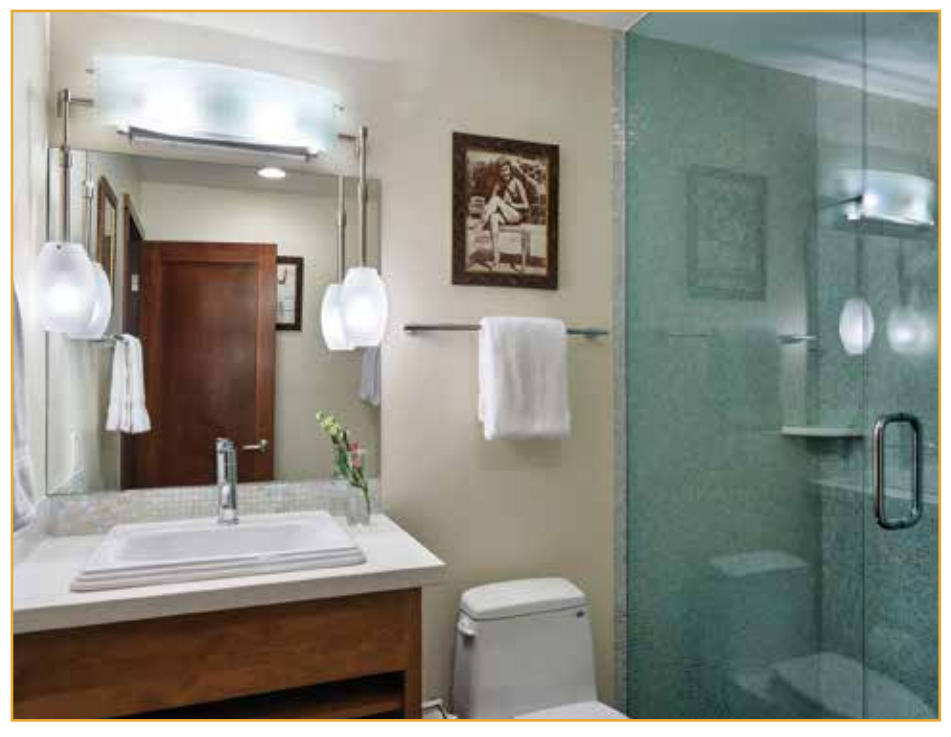
Guest master suite bath