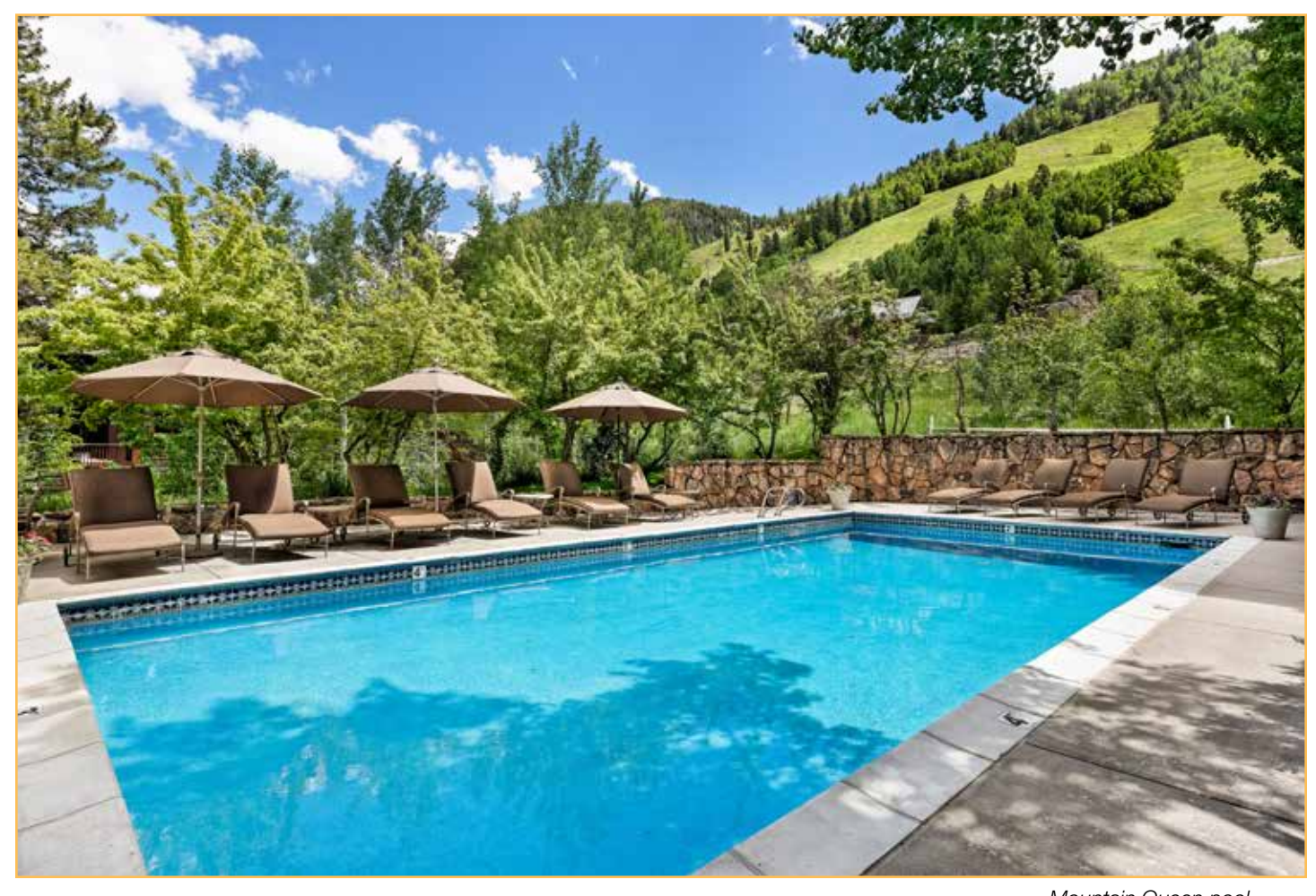
Mountain Queen pool