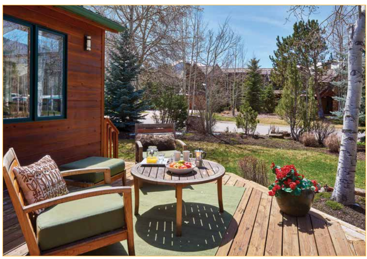
Deck views to Highlands and Tiehack