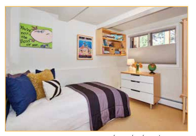
Lower level guest room