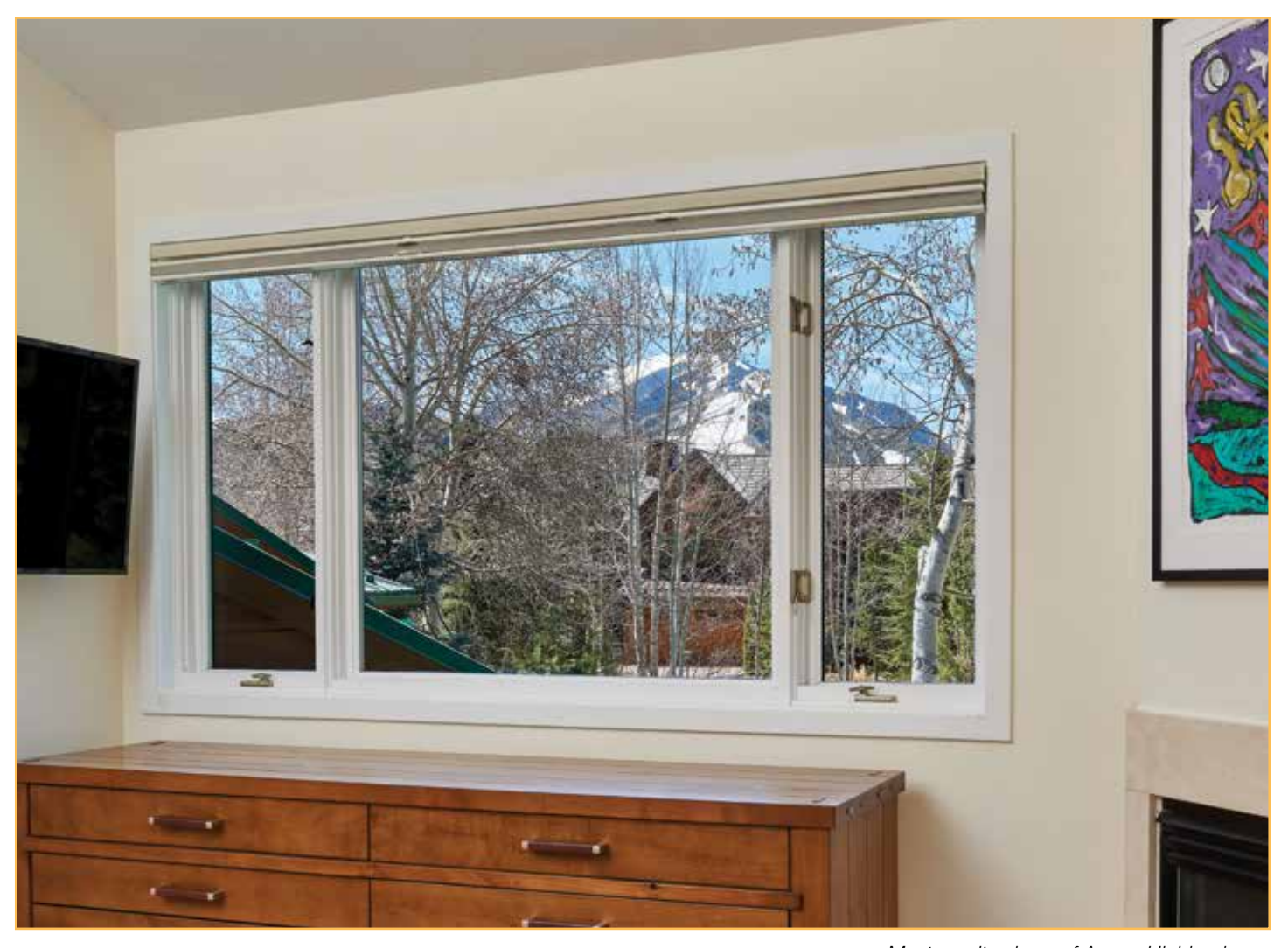
Master suite views of Aspen Highlands