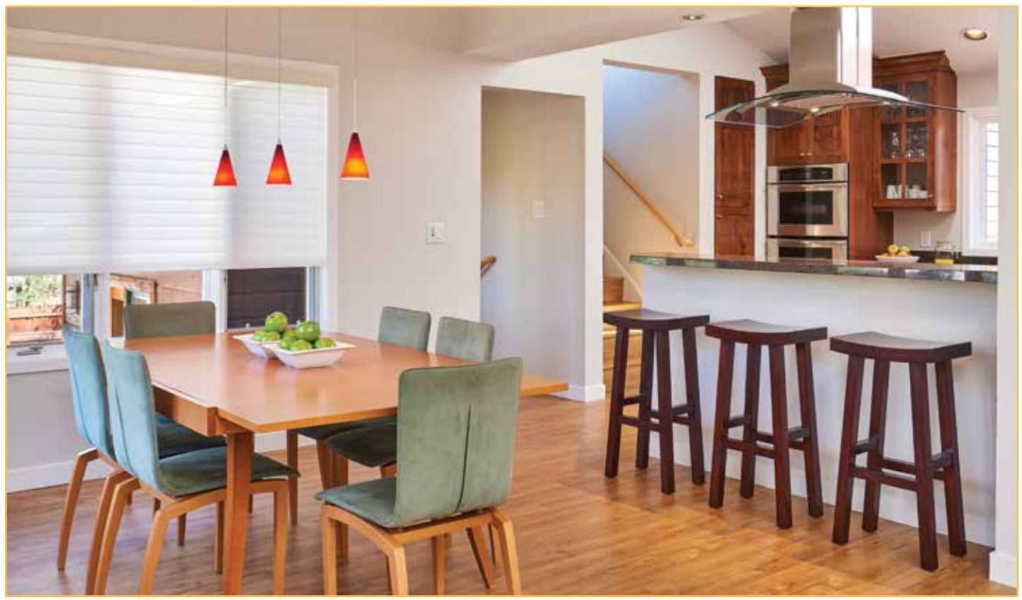
Dining area, with kitchen sitting room beyond