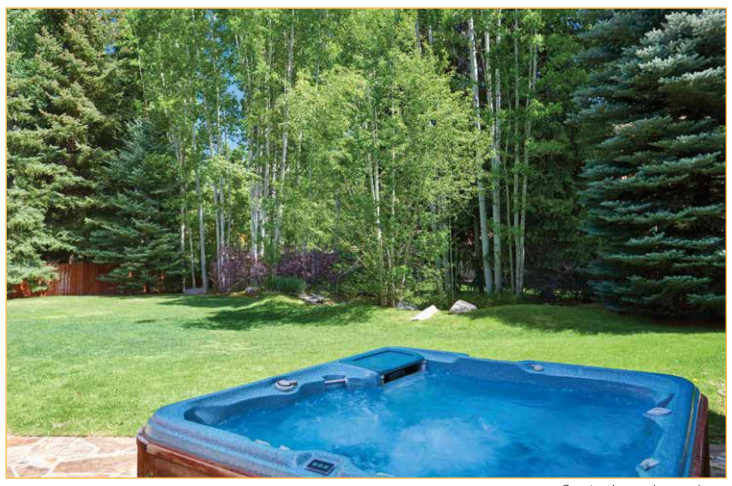
Spectacular spacious yard