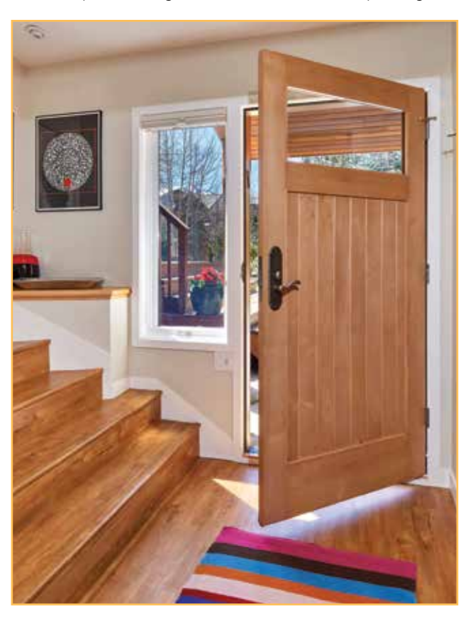
Spacious, sunny foyer generates a wonderful first impression