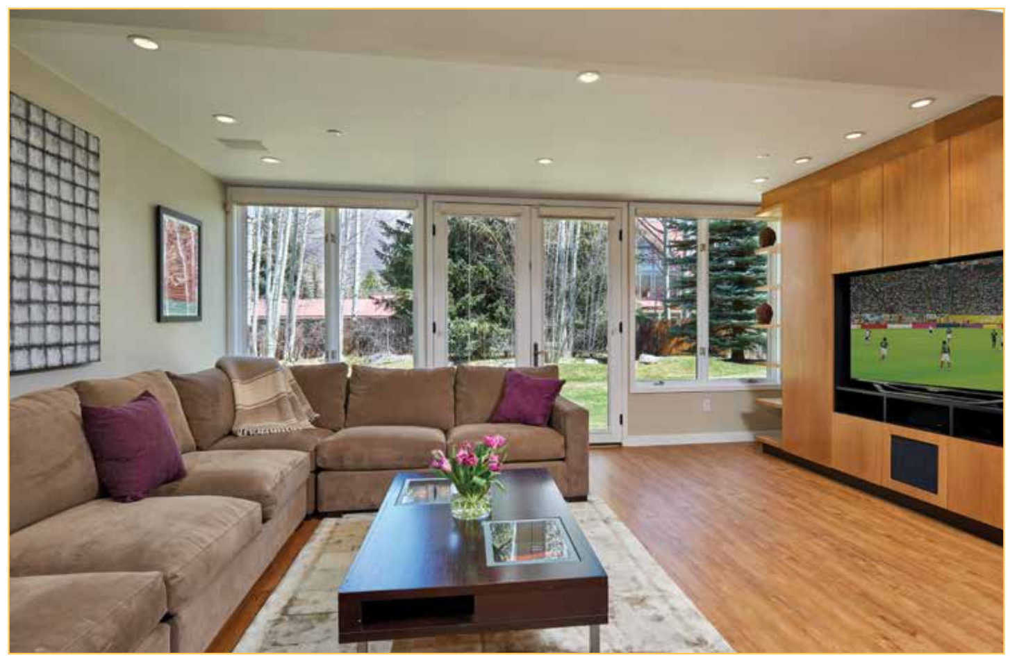
Lower level entertainment area