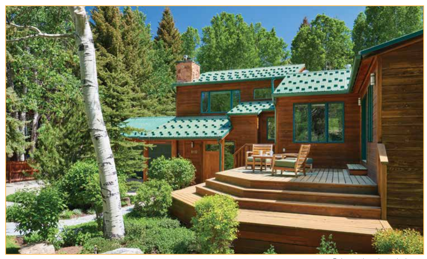
Relax on the private deck