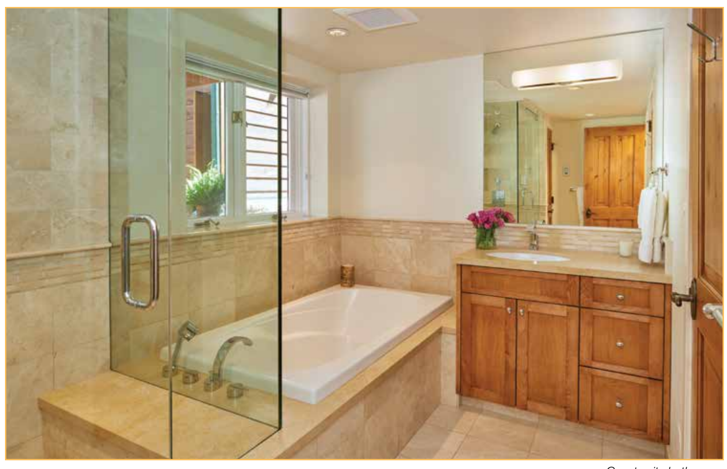
Guest suite bath