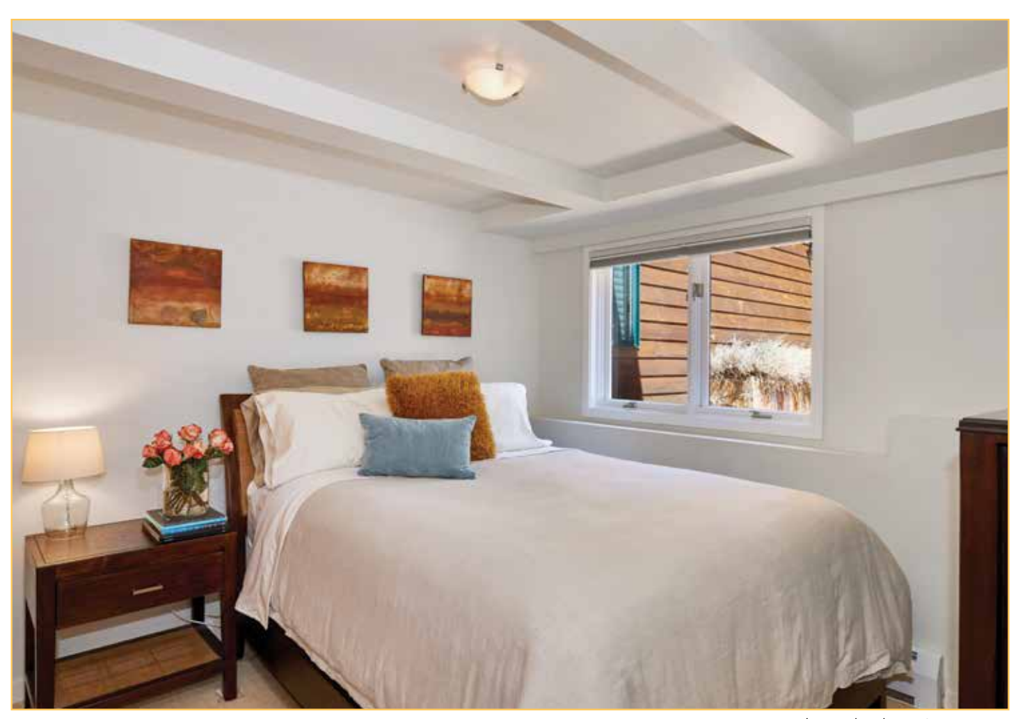
Lower level guest room