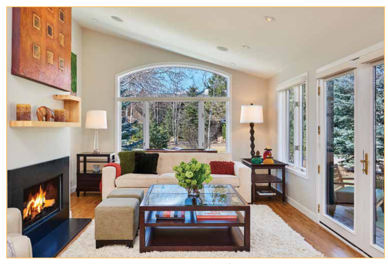
Spectacular great room with views of Aspen Highlands