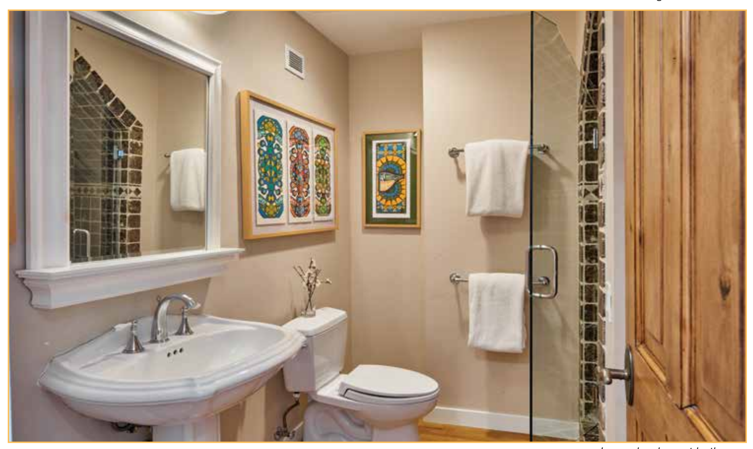
Lower level guest bath