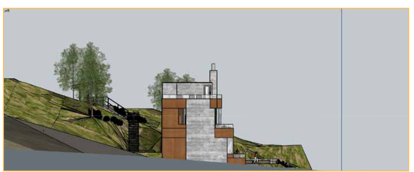
East side view