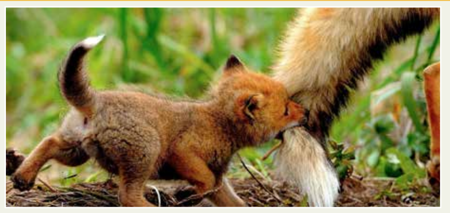
Those who contemplate the beauty of the earth find reserves of strength that will endure as long as life lasts. There is something infinitely healing in the repeated refrains of nature — the assurance that dawn comes after night, and spring after winter.

Rachel Carson(1907-1964); marine biologist and conservationist