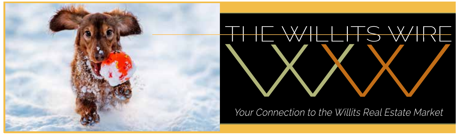
BERKSHIRE HATHAWAY HomeServices | Aspen Snowmass Properties • Winter 2018